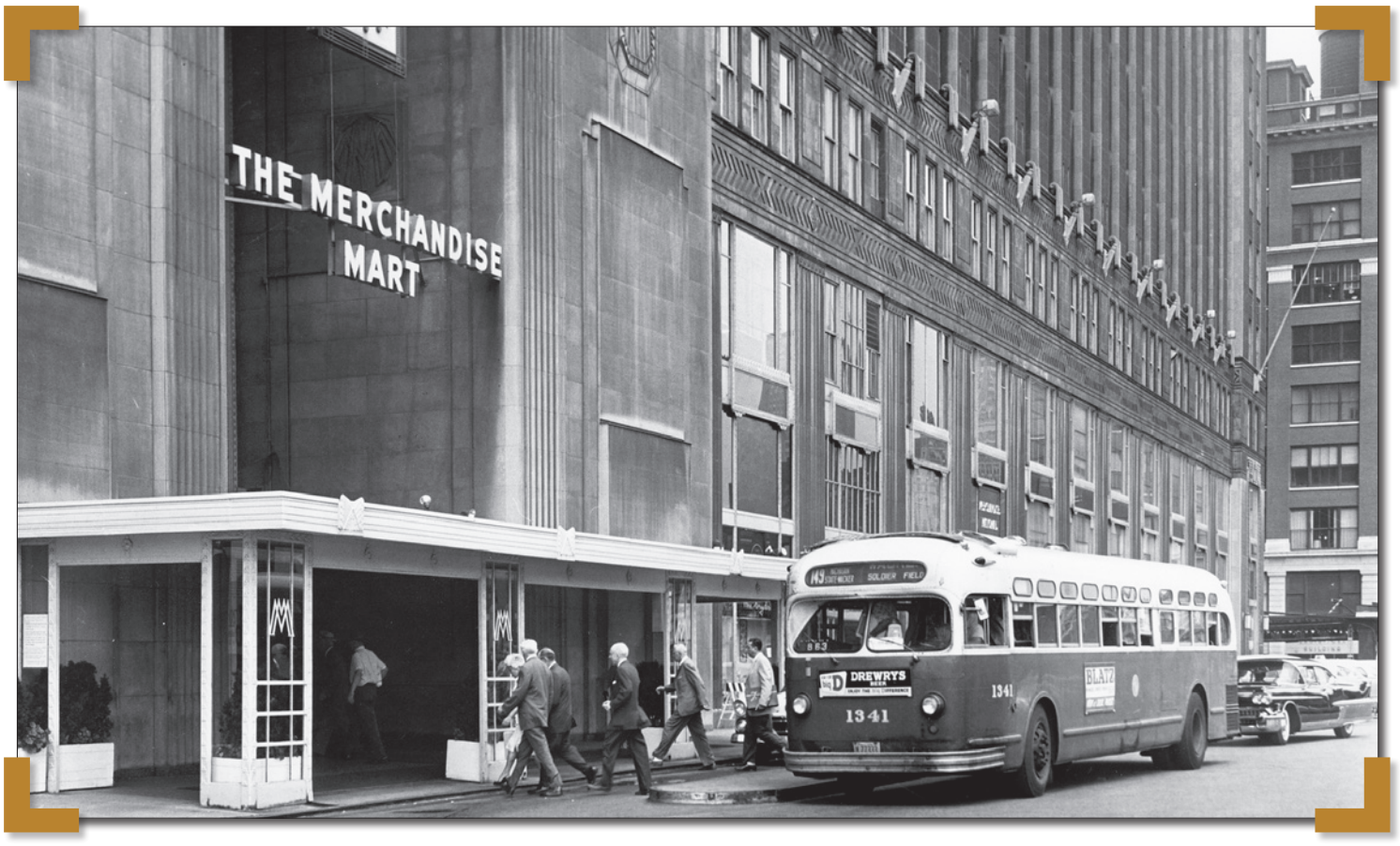
CTA bus 1341, manufactured by General Motors Corporation in 1946 for the Chicago Motor Coach Company, which later became part of CTA, drops off passengers at the Merchandise Mart in 1958.