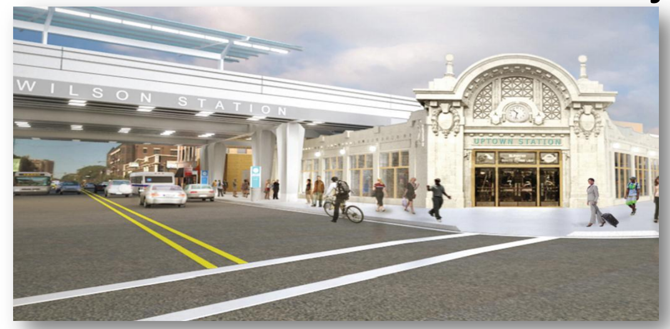
Pre - Construction Meeting