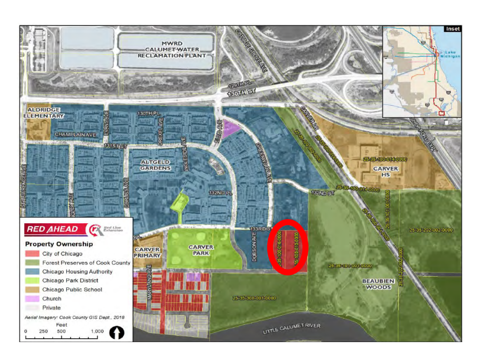
Figure 1. Red circle indicates property the FPCC is looking to acquire as part of the lower-impact scenario.