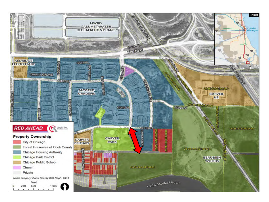
Figure 4. Red arrow indicates street segments the FPCC is looking to have vacated.