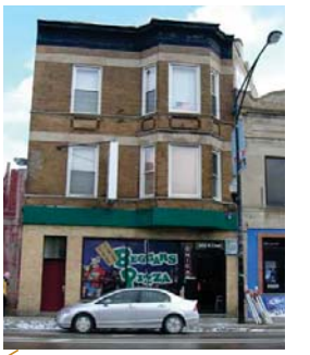
3413 N Clark St.