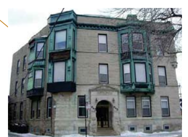
947-949 W Newport Ave.