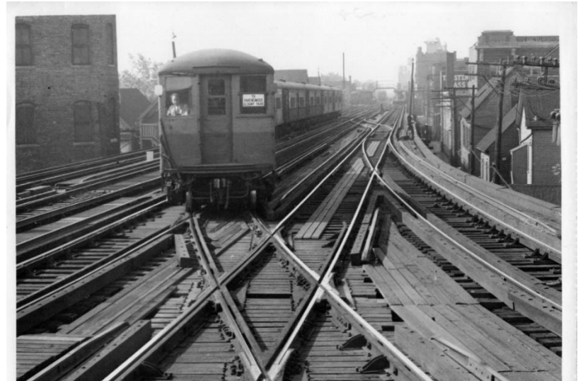
Clark Junction facing south toward Belmont, built 1907