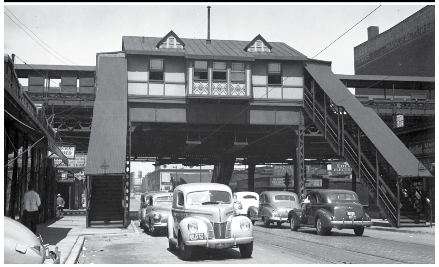
A mid-1940s view of the Lake Street Elevated Halsted station looking north on Halsted at Lake. The station was demolished in 1994 during the Green Line renovation. Similar stations remain in service today on the Green Line at Ashland/Lake and Conservatory-Central Park Drive.