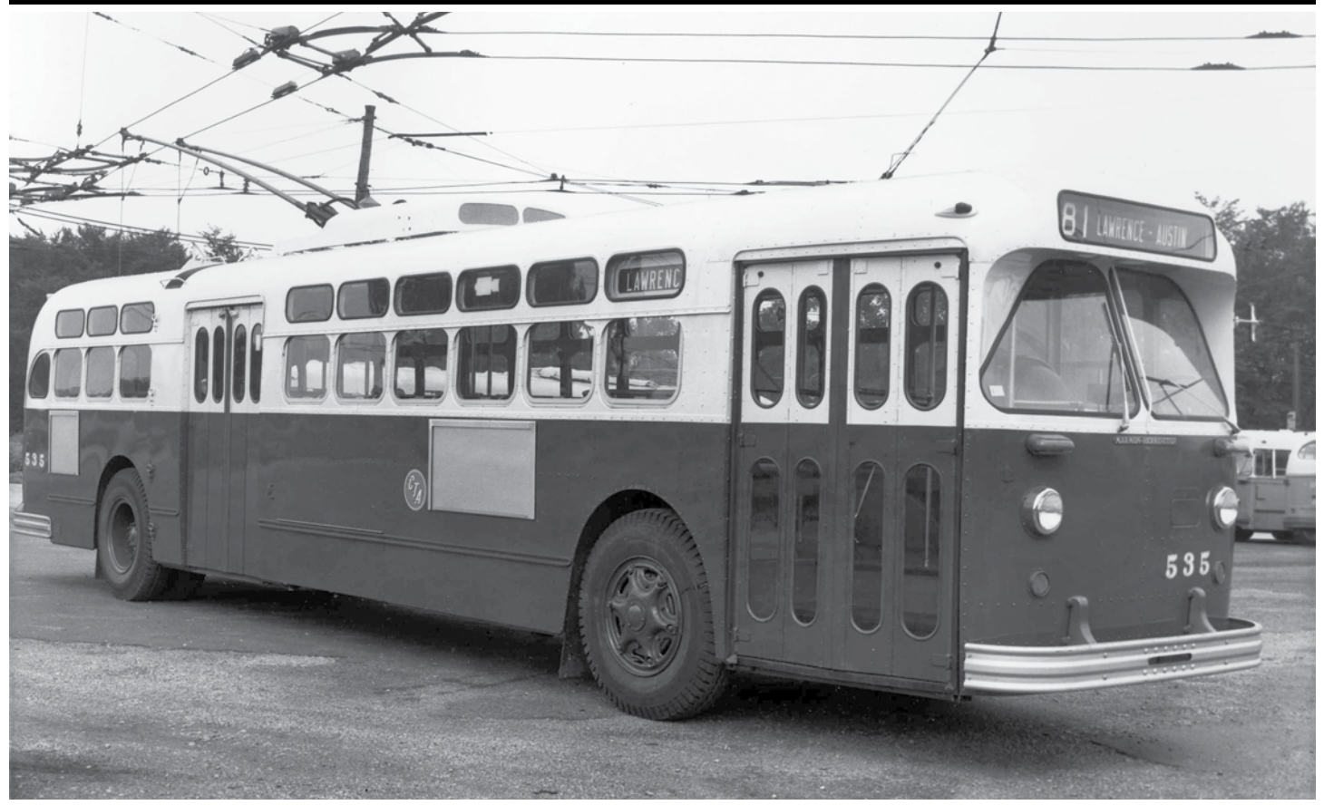
CTA trolley bus #535 (built by the Marmon-Harrington Company in 1951 and later renumbered #9535) had just recently been delivered and was assigned to the #81 Lawrence route. Three-hundred and forty-nine trolley buses of this type were delivered between 1951 and 1952, and operated on various routes until the end of trolley bus service in March of 1973. A number of these buses were sold to Guadalajara, Mexico, where they remained in service until 1993.