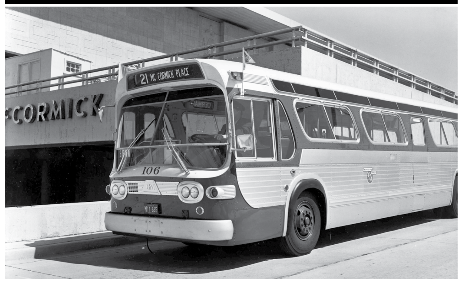
CTA #106 is pictured next to the original McCormick Place, which opened in November 1960. Manufactured by General Motors in 1961, this "New Look" bus included a number of progressive features such as large, double windows, fluorescent lighting and bright interiors. The bus is working the "Green Pennant Special," a special event route that operated between McCormick Place and the Loop during the 1960s. At the time, there was no direct bus service from the Loop to McCormick Place, so for some conventions and trade shows this special express route was operated via Lake Shore Drive. The buses were marked with green pennants on the front that said "SPECIAL".