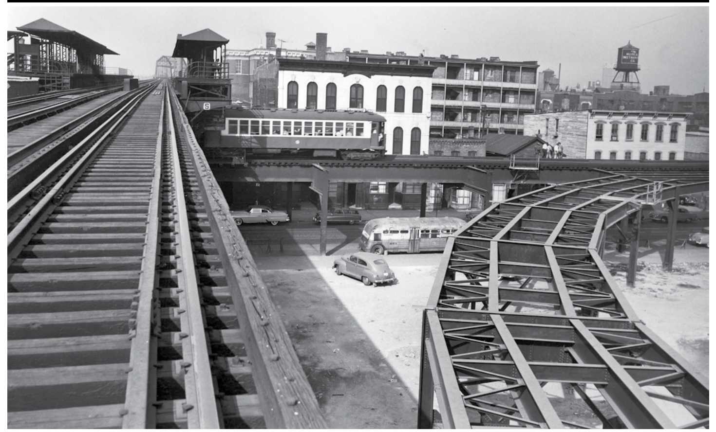
A Loop-bound Lake Street train consisting of 4000-series cars, led by a "Plushie" type car (built by the Cincinnati Car Company between 1922 and 1924), travels east. Pictured above it are the original Logan Square 'L' tracks and the Lake Street Transfer station, no longer in use at the time of the photo. Under construction is the connection between the two routes to form what would eventually become known as the Paulina Connector. The Connector allowed Douglas Park trains to reach the Loop during the 1954-58 period when its old route to the Loop was demolished to allow for construction of the Eisenhower Expressway and the Congress rapid transit line. Today, the connector is used by Pink Line trains to and from the Loop.