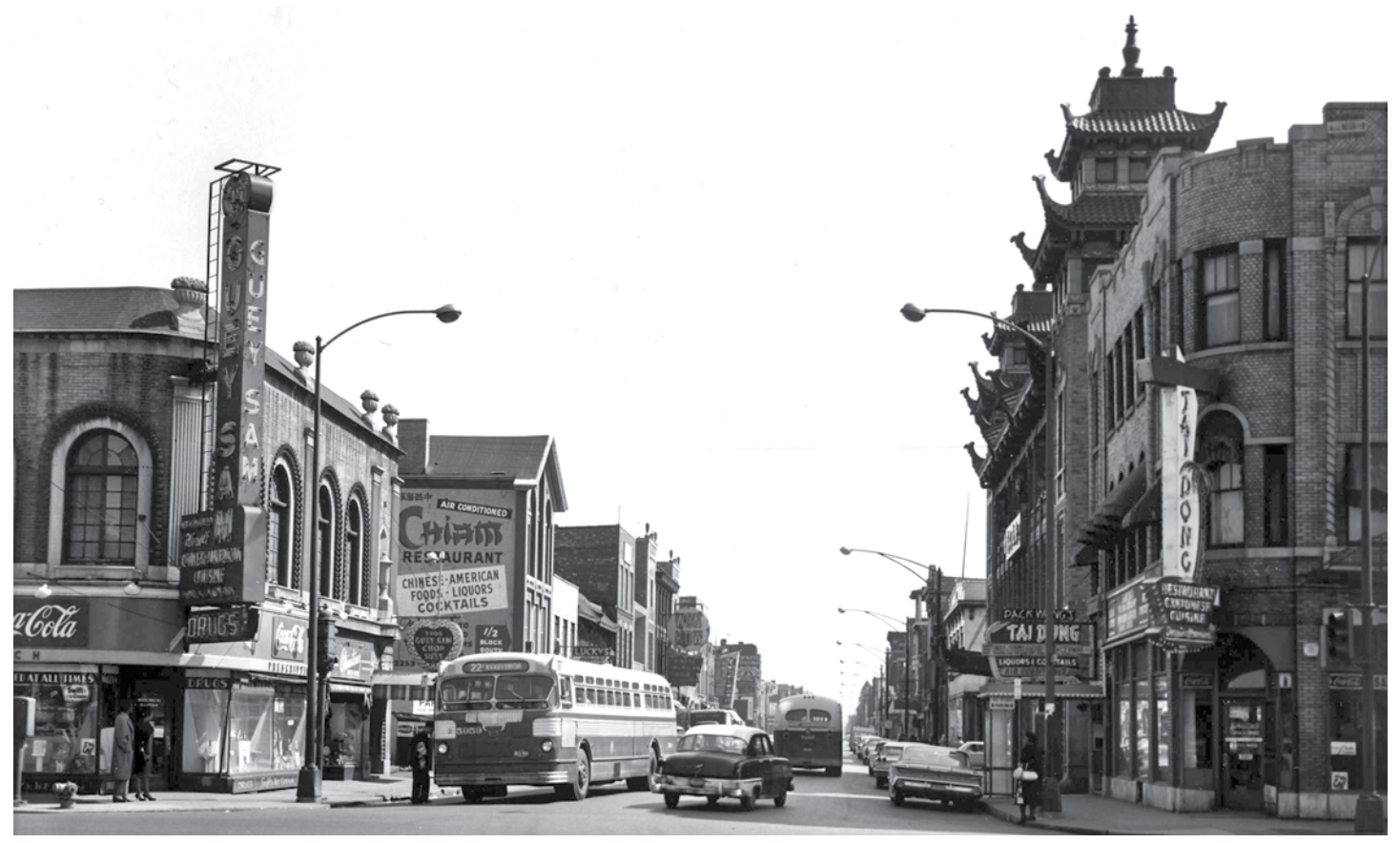
CTA #5959, manufactured by the Flxible Company in 1955, on its way northbound to downtown boards a passenger on Wentworth at Cermak in Chinatown in 1961. The bus was part of a fleet of 1,700 propane buses delivered from several manufacturers between 1950 and 1962. Aside from the addition of the Chinatown gateway arch, the Chinatown streetscape remains much the same today.