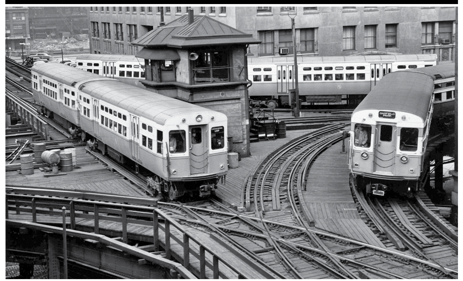
An inbound Ravenswood train is crossing Lake and Wells junction as a Garfield Park train turns south onto Wells Street while a northbound Ravenswood train rounds the curve heading to Kimball. For decades all trains operated in a counterclockwise direction on the Loop. In 1969 the tower was moved from the center of the junction to a new structure in the northwest corner of the intersection. A more modern structure in the same location as the 1969 tower was built in 2009. Today, the junction governs Green and Pink Line trains entering and exiting the Loop from the west, Brown and Purple Line Express trains entering and exiting from the north, and Orange Line trains circling around the Loop and returning to the Southwest Side and Midway Airport.