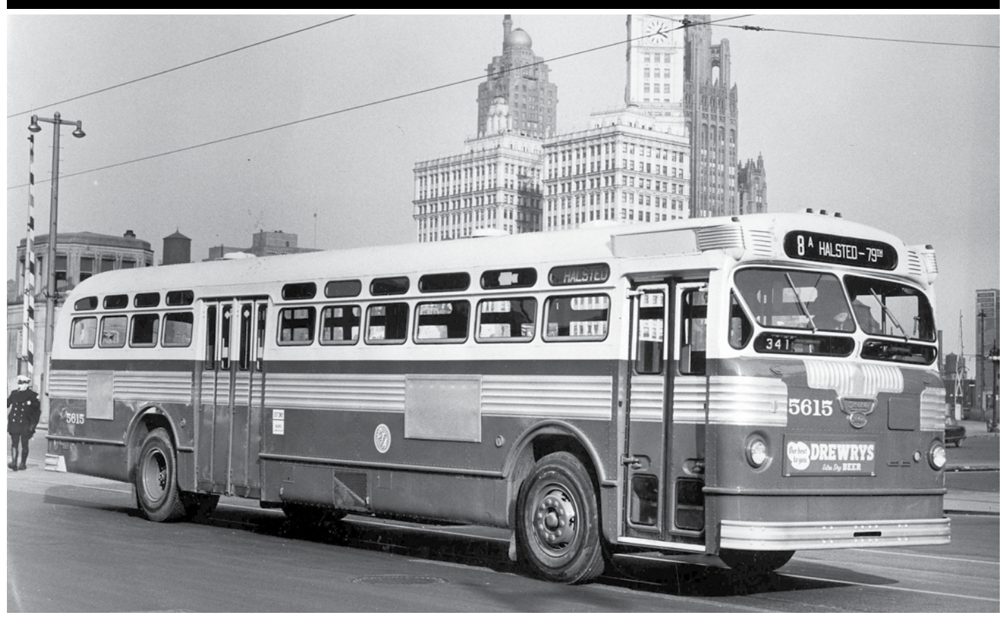
CTA Flxible Twin Coach bus #5615, manufactured by the Flxible Company in 1953, is posed on State Street at Wacker Drive. These buses were fueled by liquefied petroleum gas (propane). Chicago was one of the largest users of propane buses, with a fleet of 1,700, built by such companies as Fageol Twin Coach, Flxible, Mack, and ACF-Brill between 1950 and 1962. No doubt photographed to promote the modernization of CTA's fleet, the staged nature of the photo is revealed by the bus's destination signs – route #8A is a south extension of the Halsted Street bus and begins about 10 miles south of State and Wacker! The route designation #8A also didn't come into use until more than 20 years after the photo was taken; the route was designated #42B at the time.