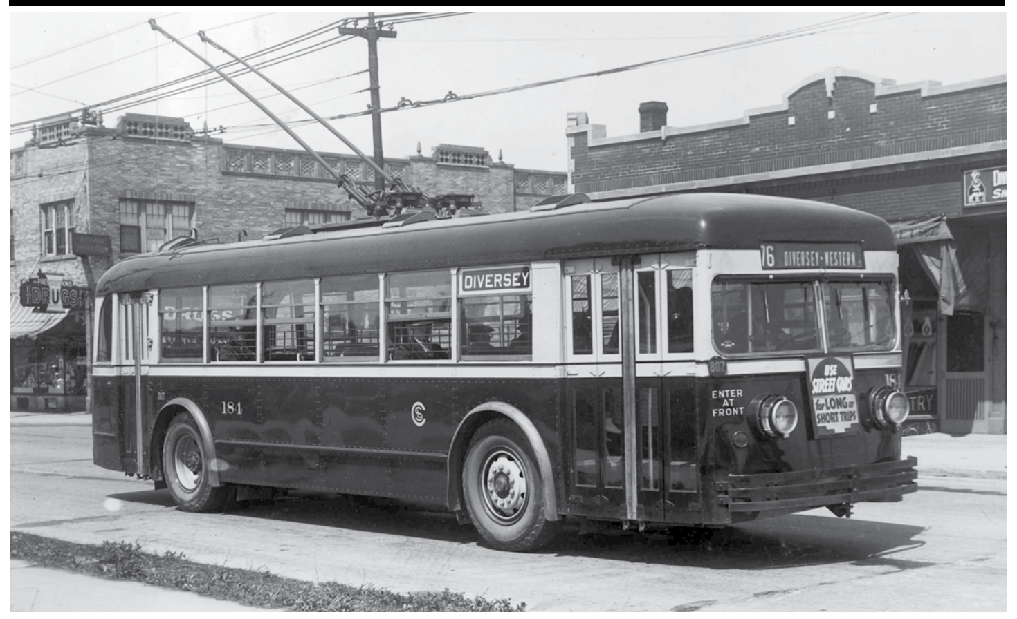
Built in 1936 by the St. Louis Car Company, Chicago Surface Lines trolley bus #184 heads eastbound via Diversey to Western. Trolley bus service was first introduced in Chicago on the #76 Diversey route in 1930. Other trolley bus routes were soon added, some as extensions of existing streetcar lines and later as conversions of streetcar lines to trolley bus service. Trolley bus extensions to existing streetcar lines were an economical way to serve new neighborhoods that were established in outlying parts of the city.