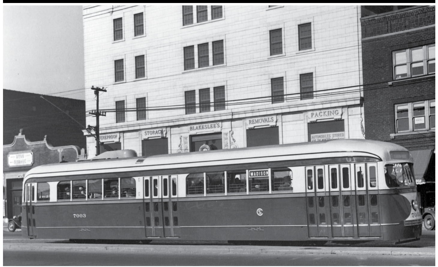
Chicago Surface Lines "Blue Goose" streetcar #7003, one of 83 built in 1936 by the St. Louis Car Company, heads toward the Loop along Madison near Cicero. The #20 Madison route was the first to receive these cars, nicknamed PCC cars for the Presidents Conference Committee. The Committee, comprised of the heads of the various street railways in North America, developed a standardized state-of-the-art streetcar design to provide a modern vehicle that would appeal to the public and be economical to produce. PCCs saw service in many American cities, including Chicago, Brooklyn, Baltimore, Boston and Pittsburgh.