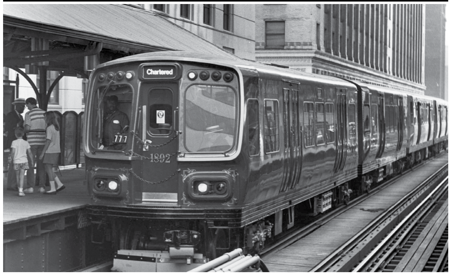
In 1992, CTA marked the 100th anniversary of Chicago's first elevated railway by painting a two-car set of Pullman 2000-series cars in the colors of the cars originally built for the South Side Rapid Transit in 1892. The commemorative cars traveled throughout the system during the anniversary. In this photo, cars #1892 (#2007) and #1992 (#2008) are leading a southbound, four-car train on Wells at Quincy station. Delivered to CTA in 1964, the 2000-series cars were the last rapid transit cars built by the Chicago-based Pullman-Standard Company for the "L" and were the first cars equipped with air conditioning. All were retired in 1994.