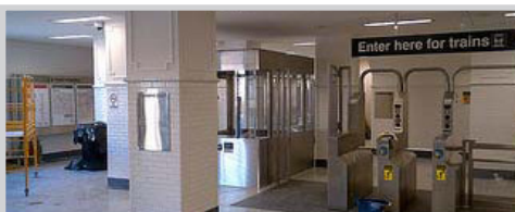
Jarvis - Station interior 12/13/2013