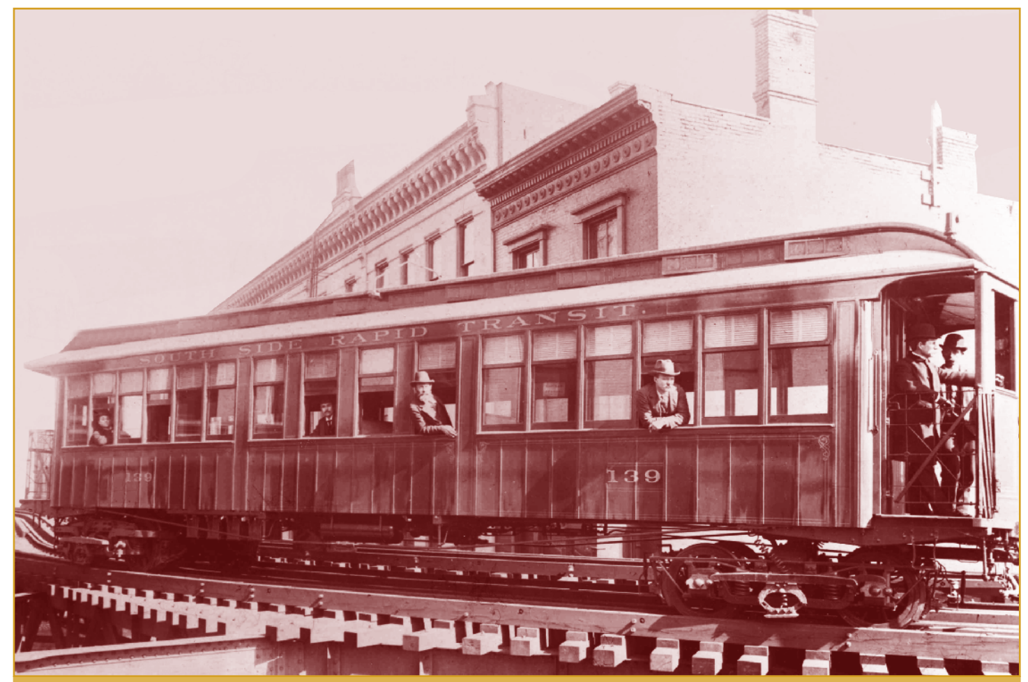
South Side Rapid Transit car #139 is seen heading southbound at the Harrison curve on the South Side Elevated in this 1898 photo. The car is testing the new electric traction equipment planned for converting the South Side 'L' from steam to electric power. Frank Sprague, the man charged with overseeing the work, is seen in the vestibule of the front car, in discussion with the motorman.