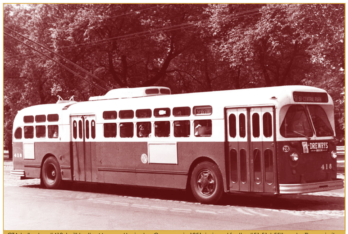
CTA trolley bus #418, built by the Marmon-Herrington Company in 1951, is signed for the #51 51st-55th route. The majority of the trolley bus routes in Chicago were concentrated on the North and West sides, however, east-west routes along 47th and 51st streets also were established.