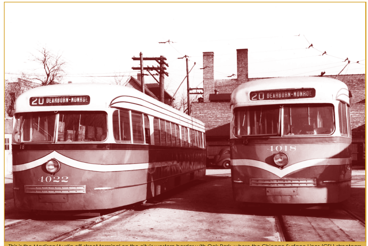
This is the Madison/Austin off-street terminal on the city's western border with Oak Park, where the Chicago Surface Lines (CSL) streetcars serving the #20 Madison line terminated. Two pre-war PCC streetcars are basking in the sun, waiting their turn to begin their eastbound trips along the #20 Madison route back to the Loop. These two cars have experimental paint schemes the CSL was testing for use on a new order of PCC streetcars.