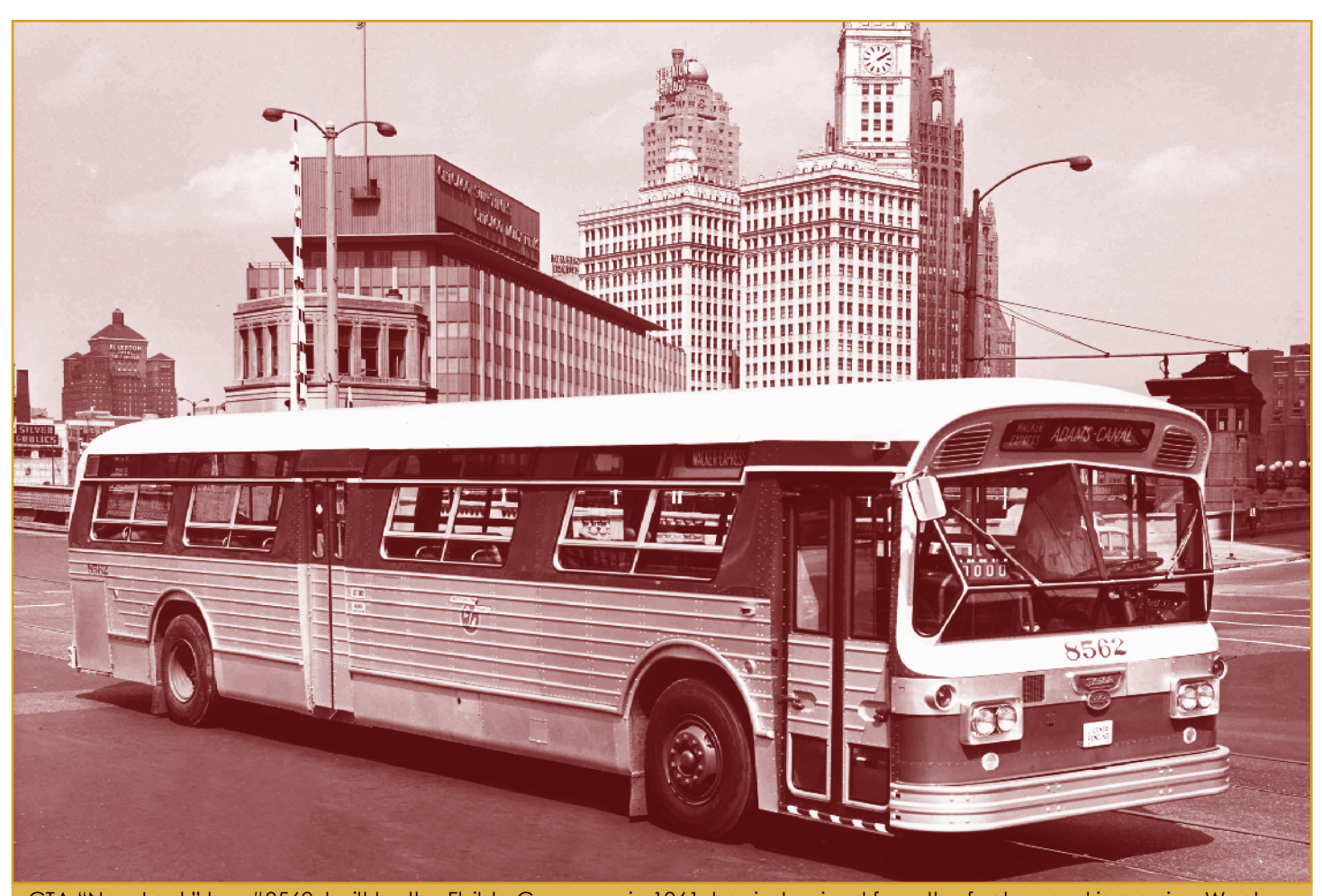
CTA "New Look" bus #8562, built by the Flxible Company in 1961, has just arrived from the factory and is crossing Wacker Drive at the Chicago River. The CTA was in the process of modernizing and enlarging its bus fleet, having completed the last of the streetcar-to-bus route conversions just a few years earlier. The 8500-series buses were used until 1975.