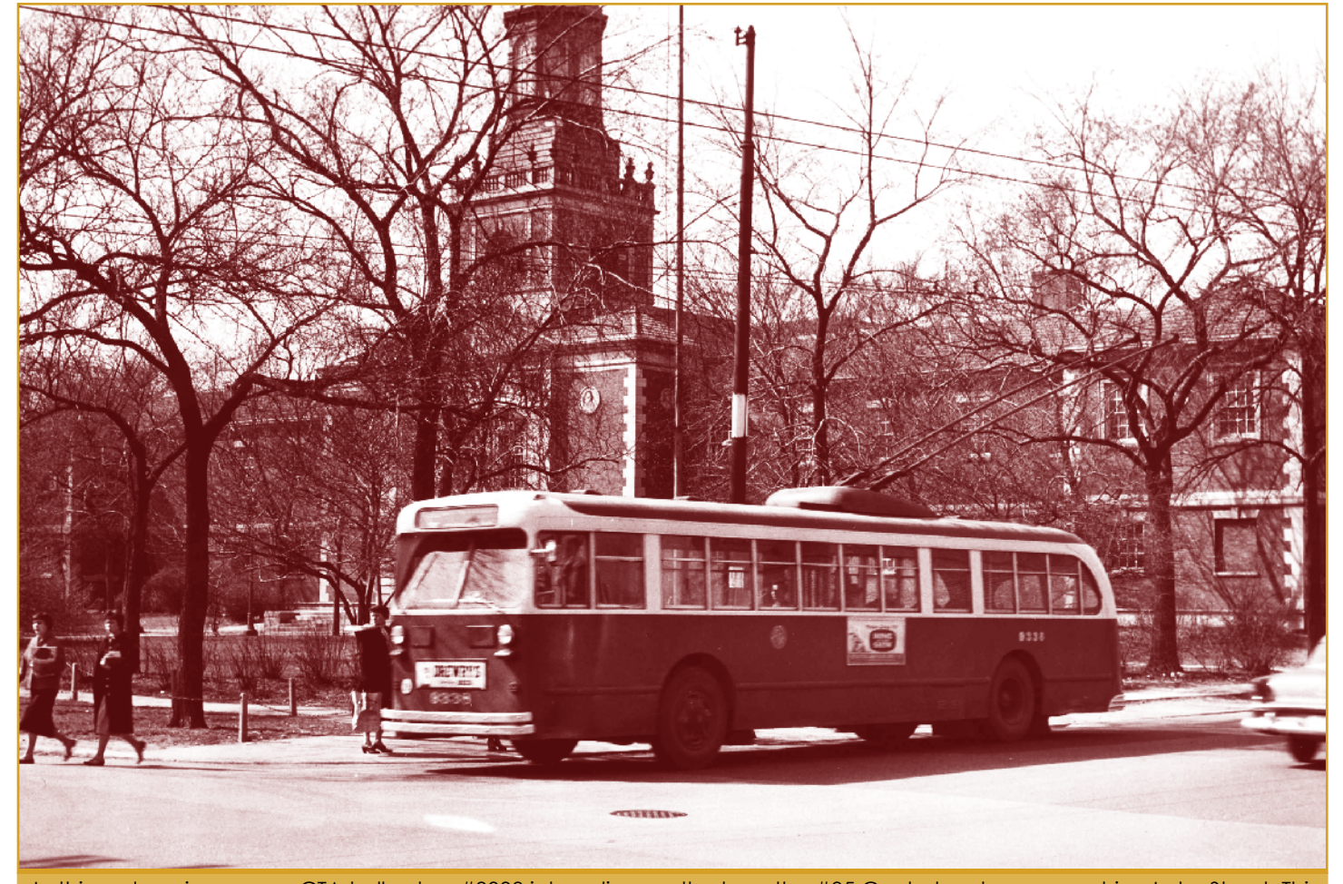
In this early spring scene, CTA trolley bus #9338 is heading south along the #85 Central route approaching Lake Street. This coach was part of a fleet of electric buses that, at its height in the 1960's, was part of the largest trolley bus system in North America. The building in the park, influenced by Philadelphia's Independence Hall, was built as a field house in 1927 on the site of the Austin Town Hall, which served the then suburb of Austin when it was still a separate community before its annexation to the City of Chicago in 1899.