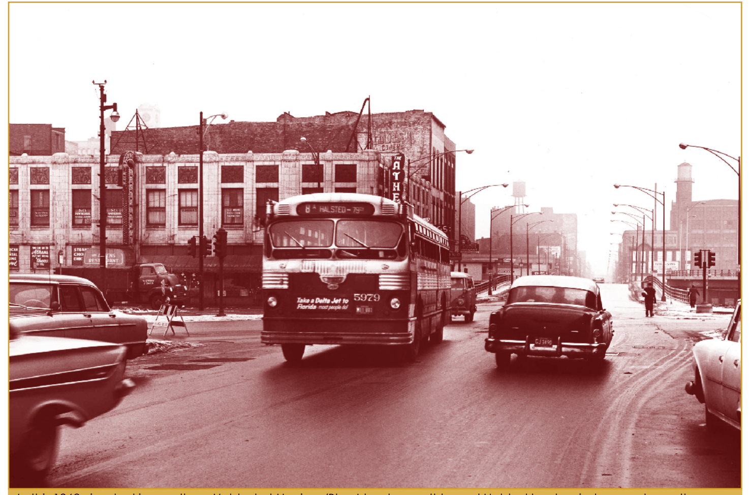
In this 1962 view looking north on Halsted at Harrison/Blue Island, a southbound Halsted bus has just crossed over the relatively new Congress Expressway on the way to its terminal at 79th Street. The buildings in the background were in their last days before being demolished for the development of a new University of Illinois campus.