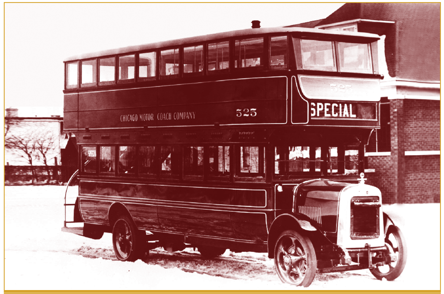
Chicago Motor Coach Company bus #525 is seen here, newly arrived from the Yellow Coach Manufacturing Company in 1923. The earliest motor bus routes were established on the city's park boulevard system due to the local park boards awarding franchises to bus companies rather than to street railways. The Chicago Motor Coach Company's fleet initially consisted of double decker buses that provided additional capacity, as well as great views from the upper level.