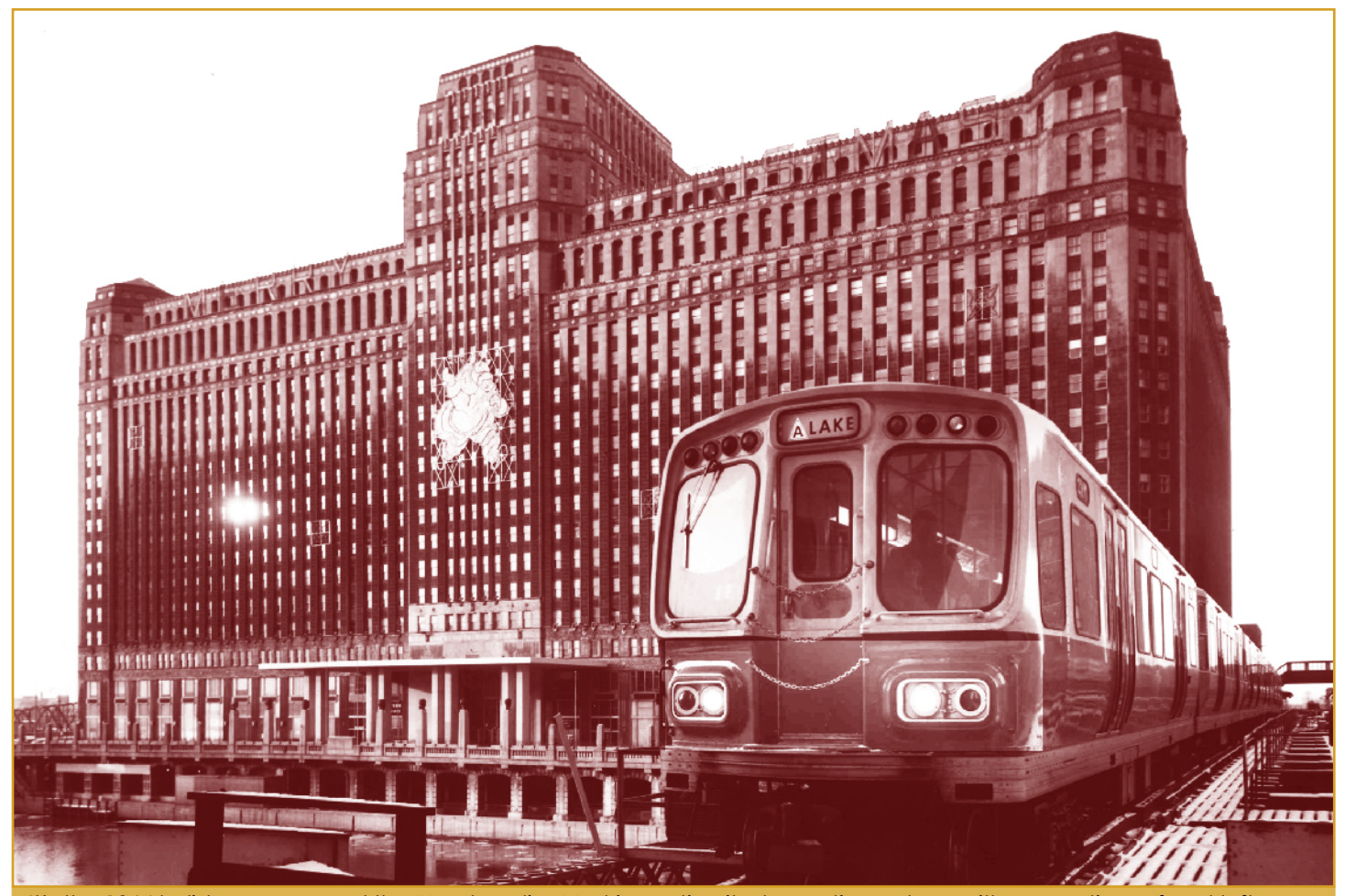
It's the 1964 holiday season and the Merchandise Mart is sporting its decorations, along with generations of soot left over from many years of coal burning heat used in the city. A train of newly-arrived 2000-series cars built by the Pullman-Standard Company in Chicago is posed for photos on the Wells Street Bridge over the Chicago River.