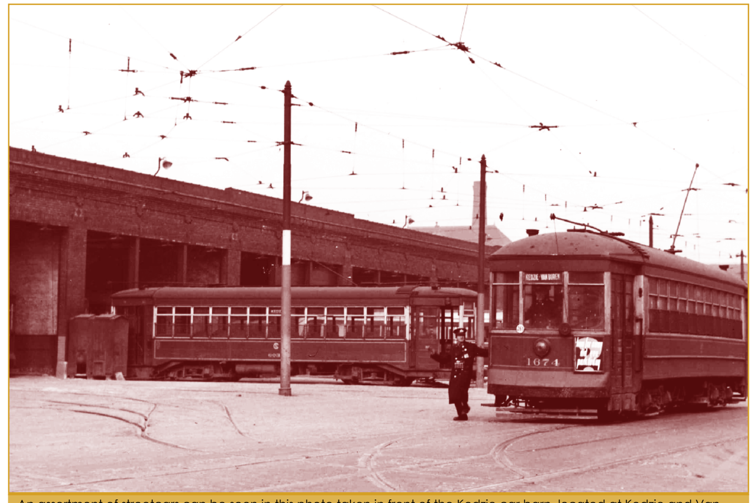
An assortment of streetcars can be seen in this photo taken in front of the Kedzie car barn, located at Kedzie and Van Buren. Chicago Surface Lines (CSL) #1674 is most likely pulling out of the car barn to begin a trip on the Division-Van Buren route. Car #1674 was originally built in 1912 for the Chicago Railways, a predecessor to the CSL.