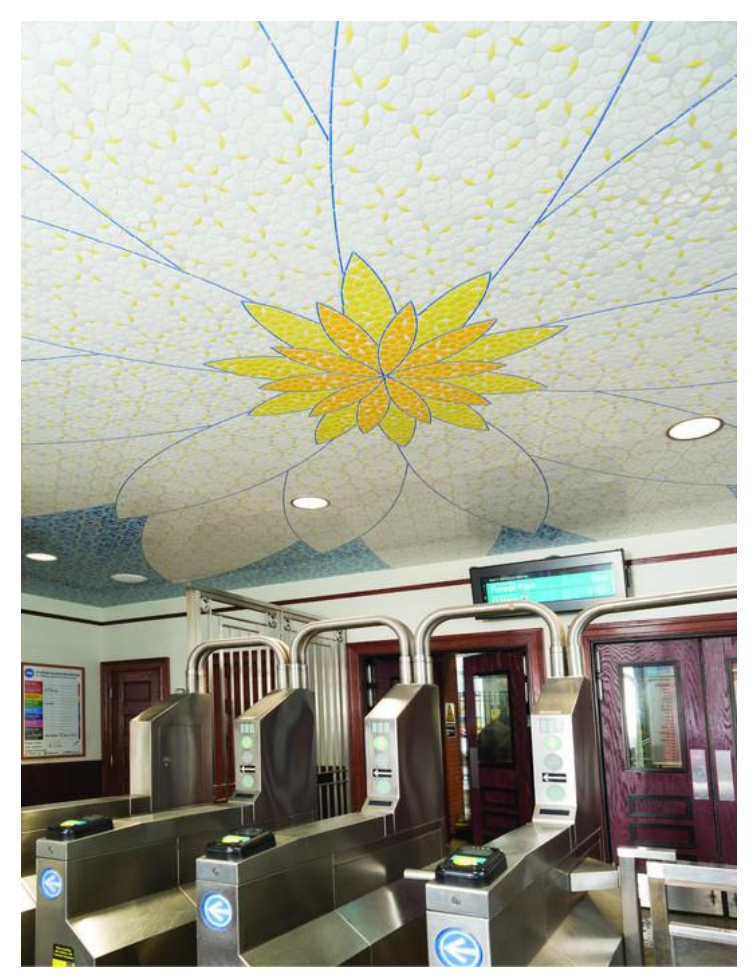
Blue Line California station Patrick McGee, Artist

The CTA is home to an impressive collection of art including mosaics, image transfer artworks and sculptures.