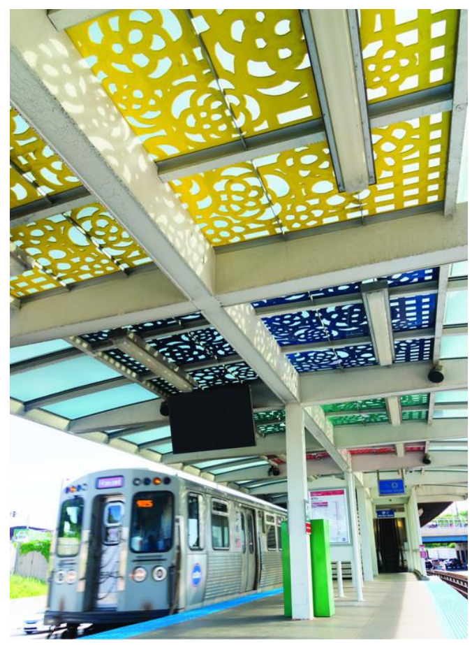
Red Line 47<sup>th</sup> Street Station Jo Hormuth, Artist

The Chicago Transit Authority (CTA) incorporates quality design in construction projects and, from time to time, commissions and installs public art for CTA riders and the communities it serves.