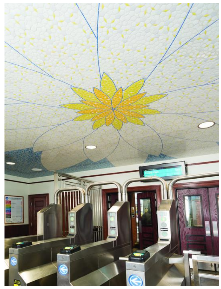
Blue Line California station Patrick McGee, Artist

The CTA is home to an impressive collection of art including mosaics, image transfer artworks and sculptures.