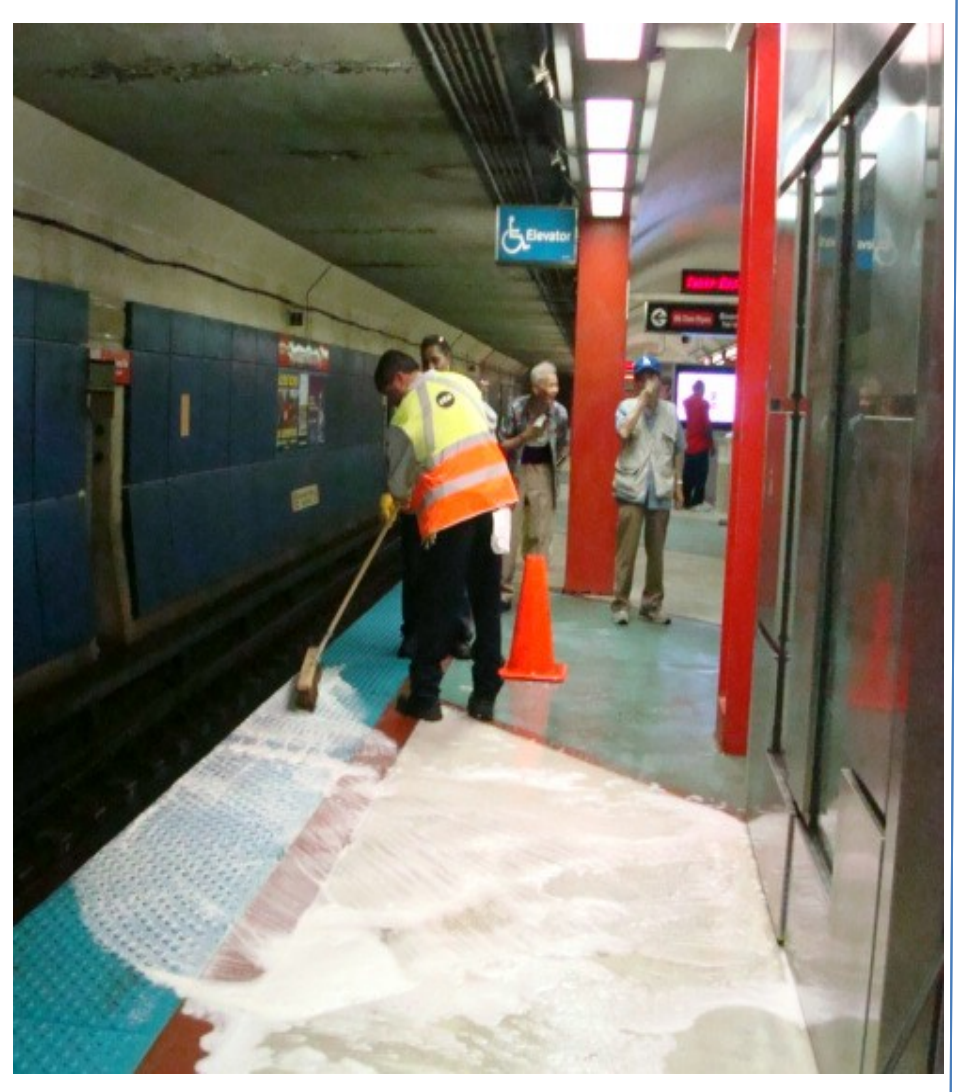
Roosevelt – Subway platform