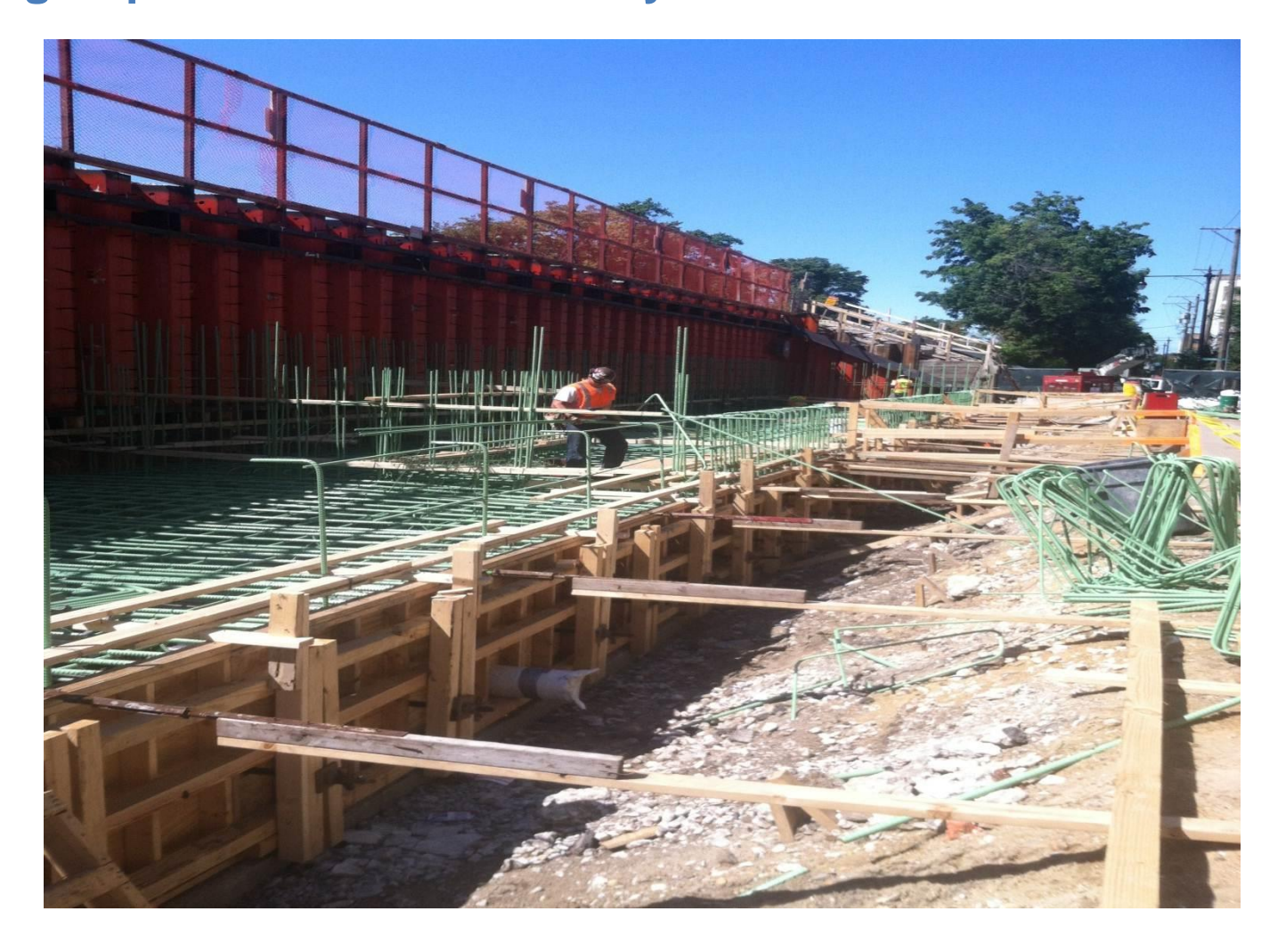
Contractor installing reinforcing bars for foundation installation at Farwell Substation