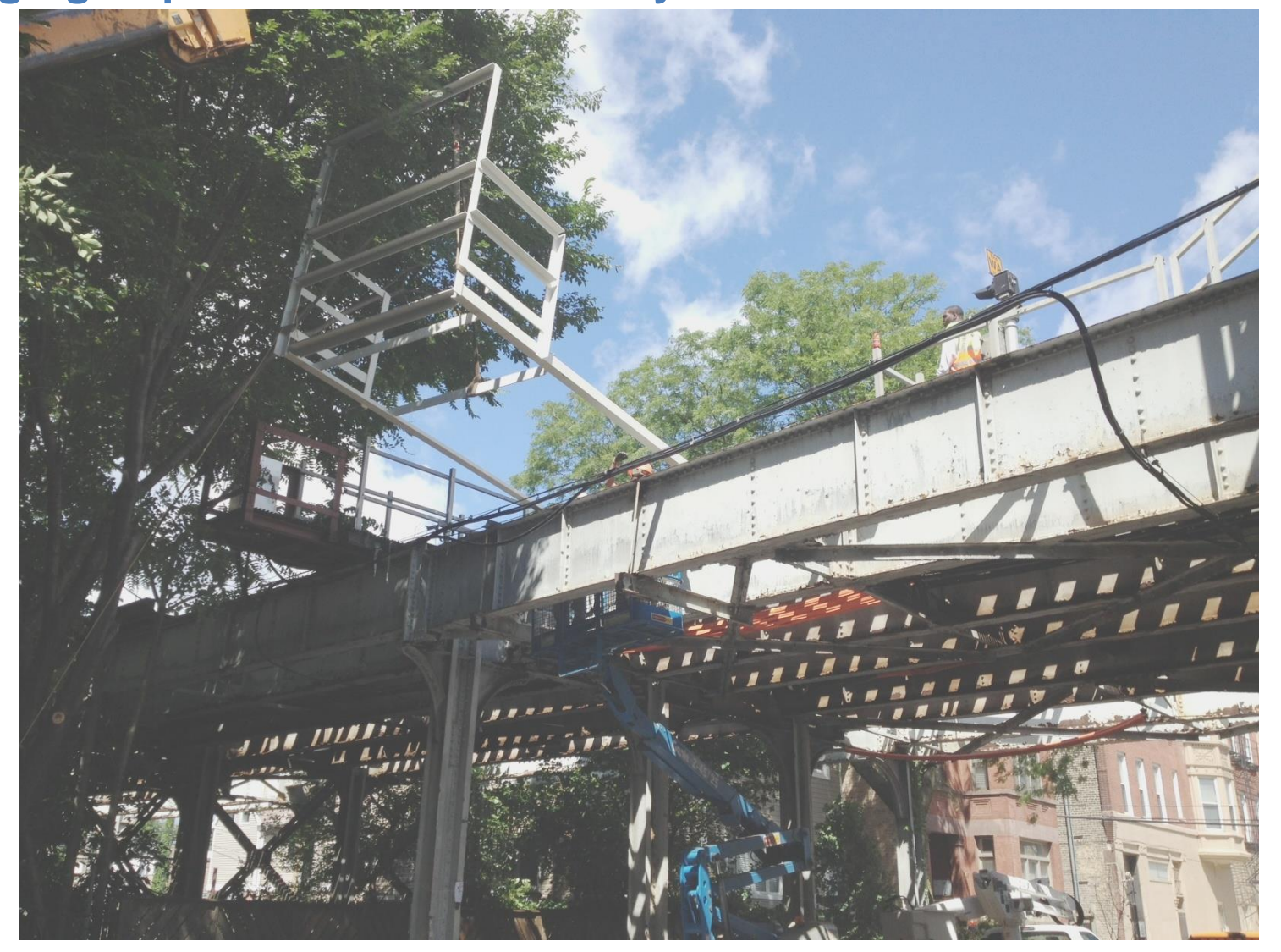
Platform for getaways at Armitage Substation