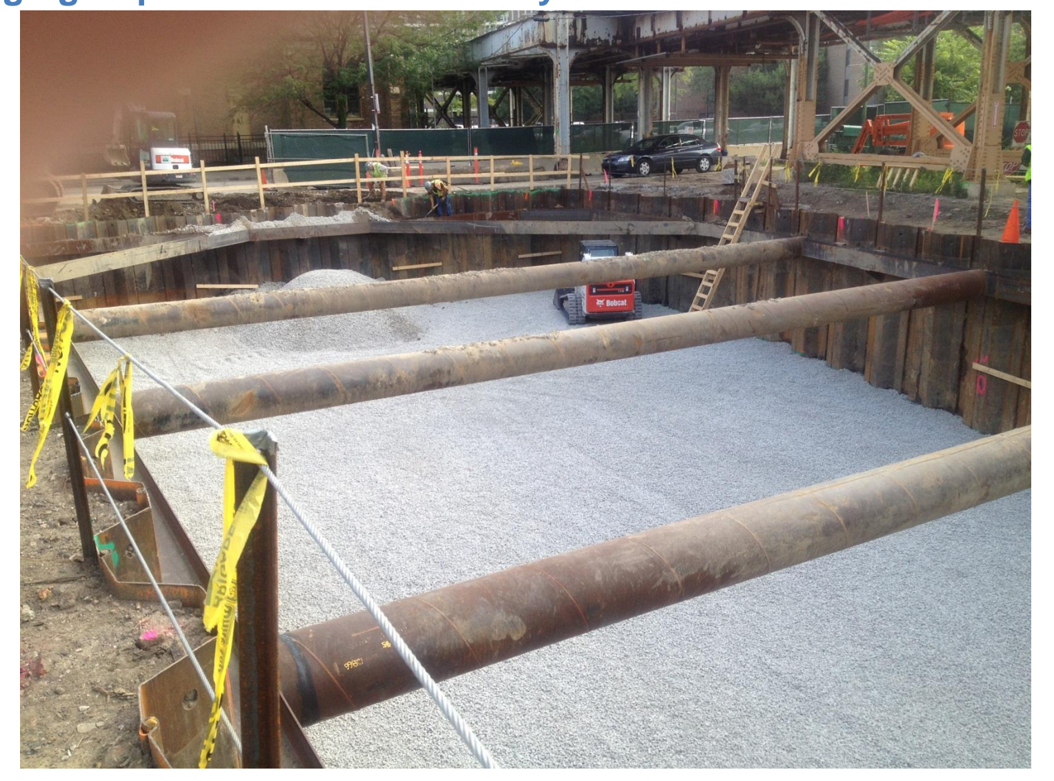
Hill worksite, ERS and CA-7 stone, preparation for foundation installation