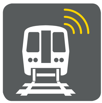
Dark on light version