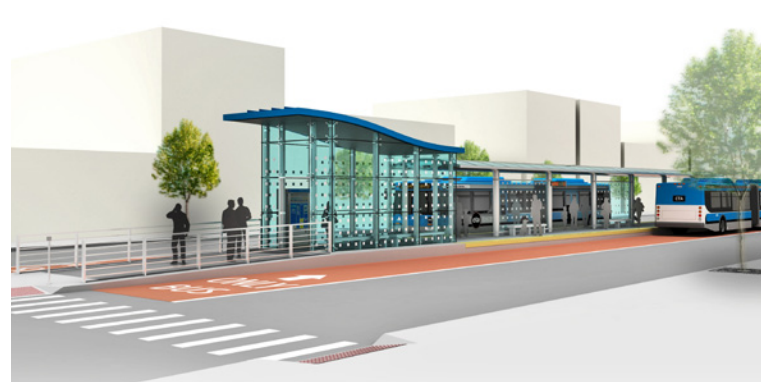
Conceptual Rendering of an Ashland BRT Station

The purpose of the Ashland Avenue BRT Project is to expand connectivity to the region's existing transit system by providing a new and upgraded high quality, high capacity and cost effective premium transit service—a service which provides faster, more reliable, and comfortable passenger experience. The proposed project would address the transportation needs of expansive population and employment growth outside of the Central Business District or "Loop" and support local and regional land use, transportation and economic development initiatives. Specifically, the project will improve accessibility, mobility, transit travel times and reliability, and passenger facilities in this heavily transit reliant corridor.