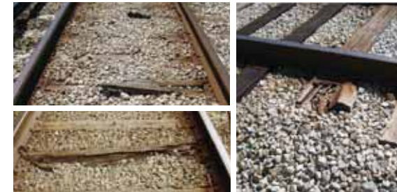
Deteriorated ties and trackbed on the Dan Ryan branch 'L', like these, are requiring slower train speeds and longer trip times.

Starting this May, the Red Line will be completely closed for five months, from the Cermak-Chinatown station to the 95th Street station. CTA will offer several alternative travel options during this closure to minimize the impact on customers as much as possible (see other side of this brochure).