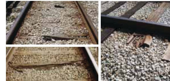
Deteriorated ties and trackbed on the Dan Ryan branch 'L', like these, are requiring slower train speeds and longer trip times.

Starting this May, the Red Line will be completely closed for five months, from the Cermak-Chinatown station to the 95th Street station. CTA will offer several alternative travel options during this closure to minimize the impact on customers as much as possible (see other side of this brochure).