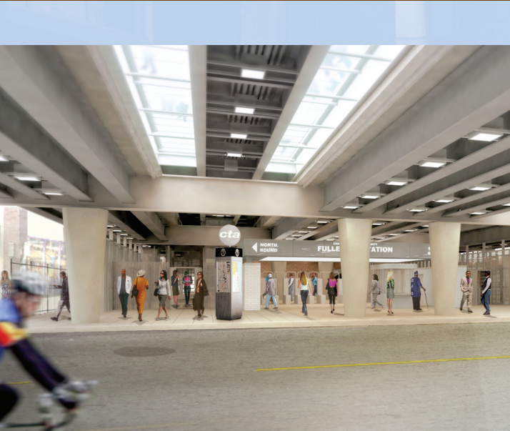
Rendering of Fullerton CTA Station.