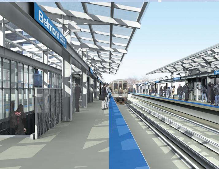
Rendering of Belmont CTA Station.

Operating trains on one less track at Belmont and Fullerton results in more crowded trains and longer commutes for riders on the Brown Line, Purple Line Express and north branch of the Red Line.