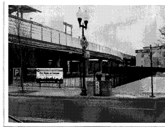
Subject Site Facing Northwest