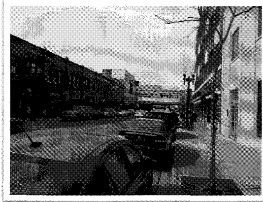
View West Along Belmont Avenue- CTA Belmont Station In Background