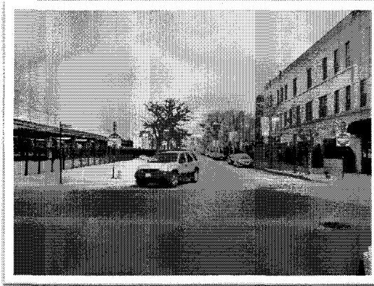
Wilton Avenue Facing North – Subject To Left