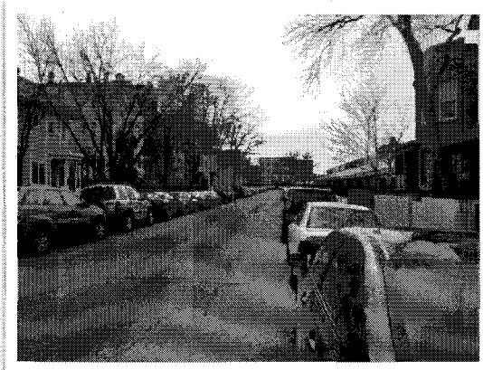
Wilton Avenue Facing South – Subject To Right