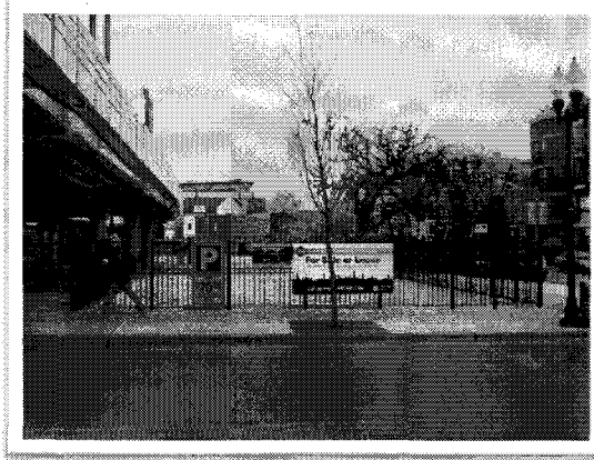
Subject Site Looking North