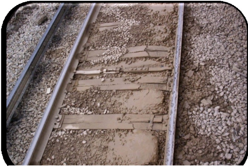
Poor track conditions require slow zones