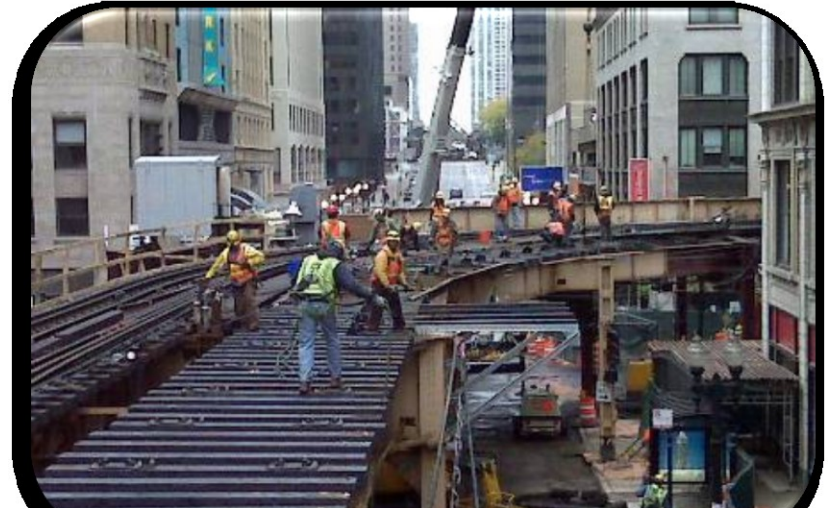
Ties, track, and infrastructure work for faster, more efficient service