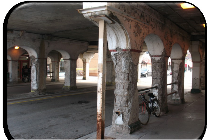
Poor structure condition requires temporary measures