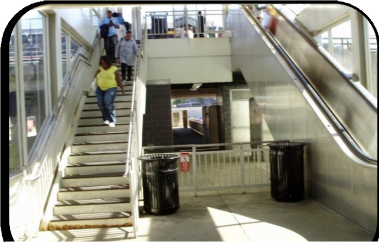
Station repairs and upgrades for better customer experience