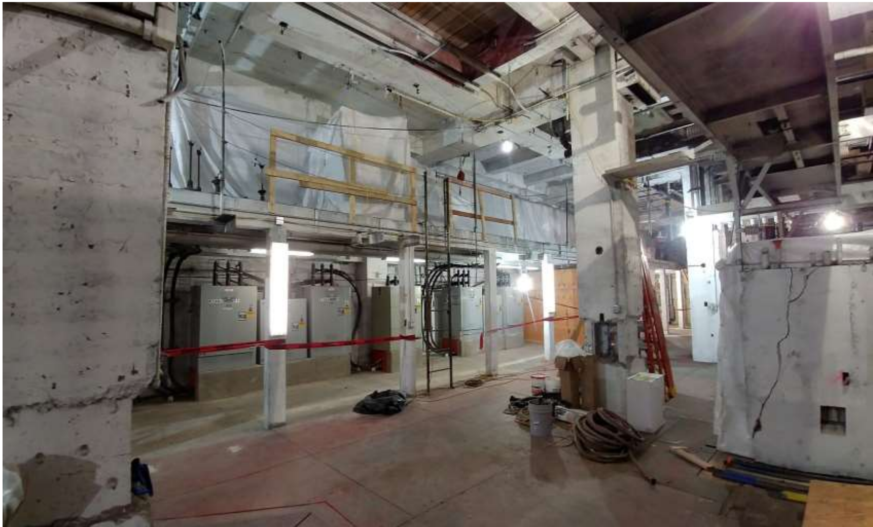
ComEd 140 kV Equipment Protected from Lead Paint Abatement at East Lake Substation