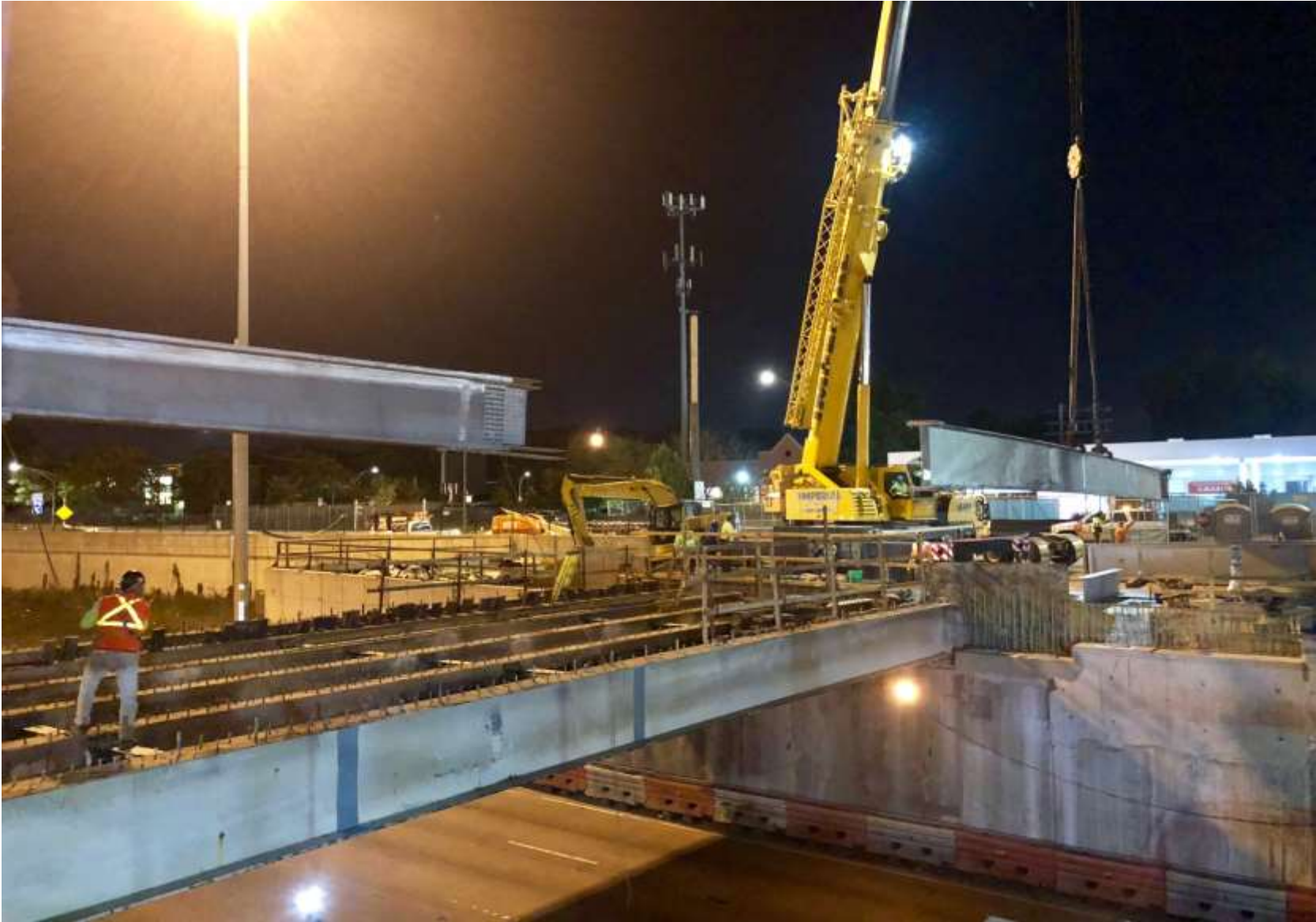
Steel Erection for North Bus Bridge Widening