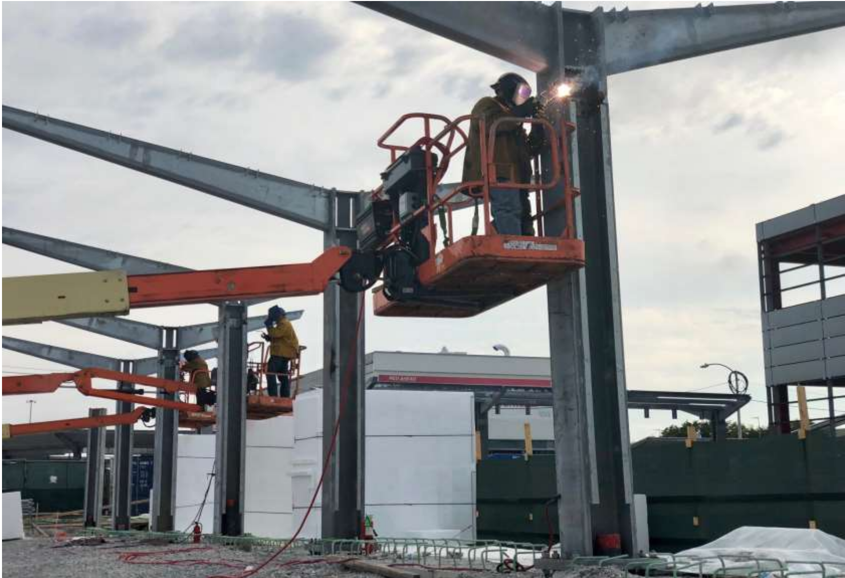
Bus Canopy Steel - Crossarms and Column Welding