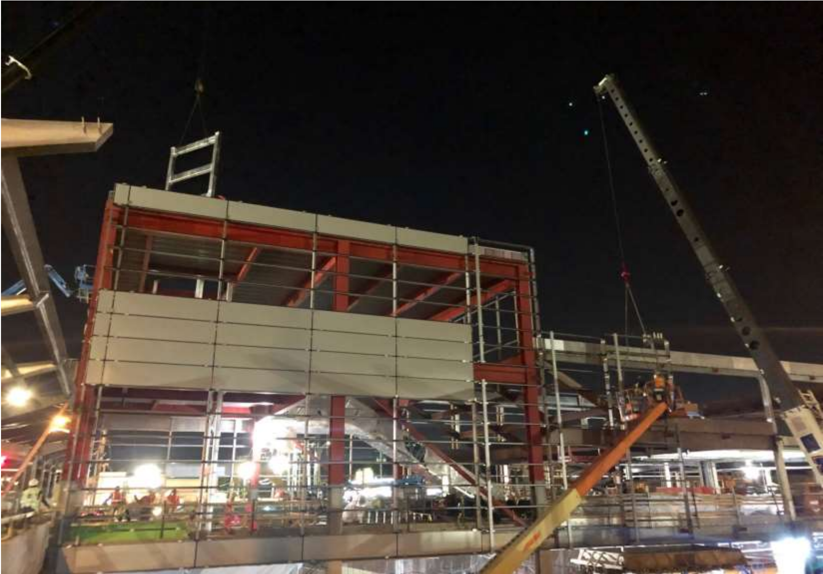
Elevator Tower Steel Erection (left) and Curtainwall Framing Install (right)