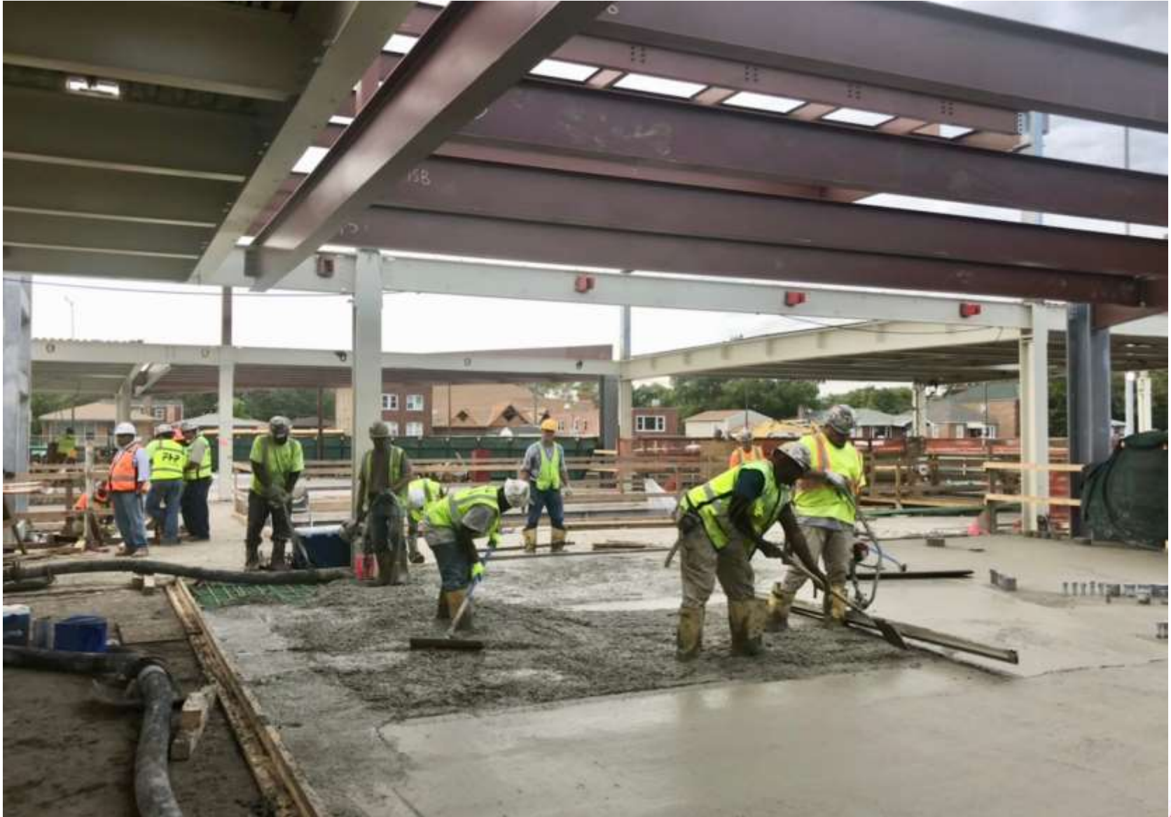
Concourse Level Structural Slab Concrete Pour