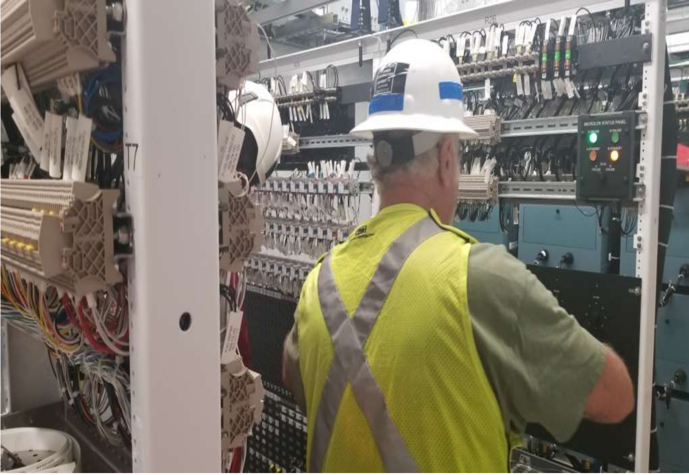
Control Line Testing at Cleveland Relay House