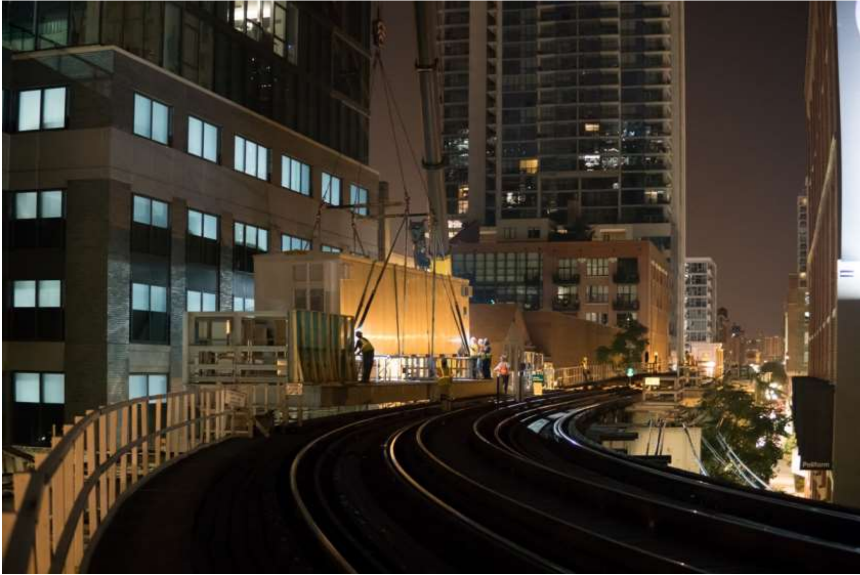
Setting of Illinois Relay House