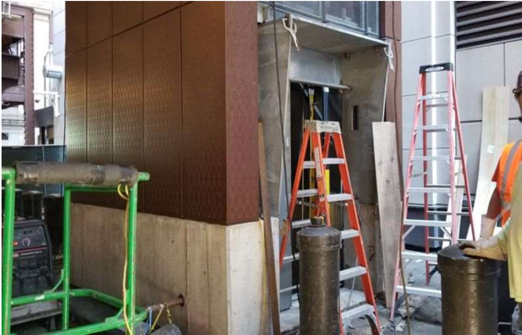
New Elevator Entrance Shroud Enclosure Installation