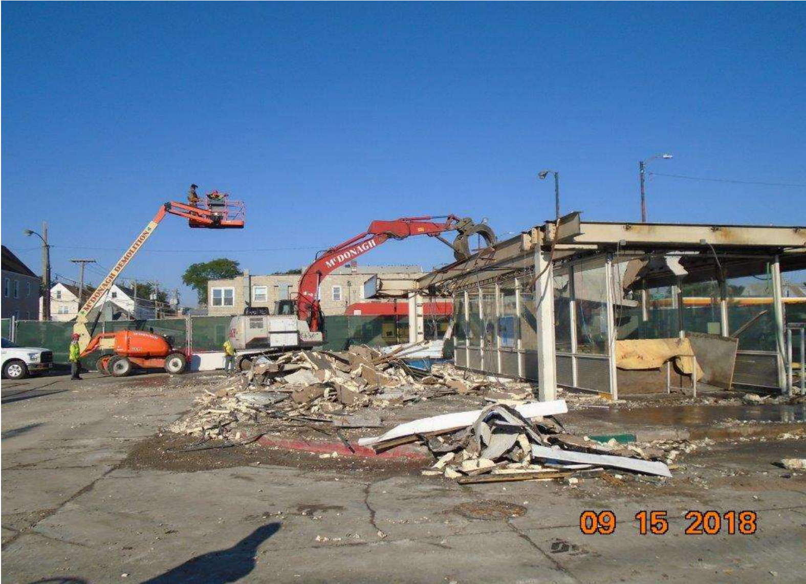
Demolition of Existing Station Canopy