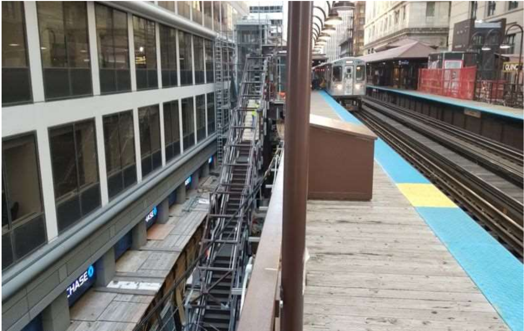
New Exit Stair Build Out