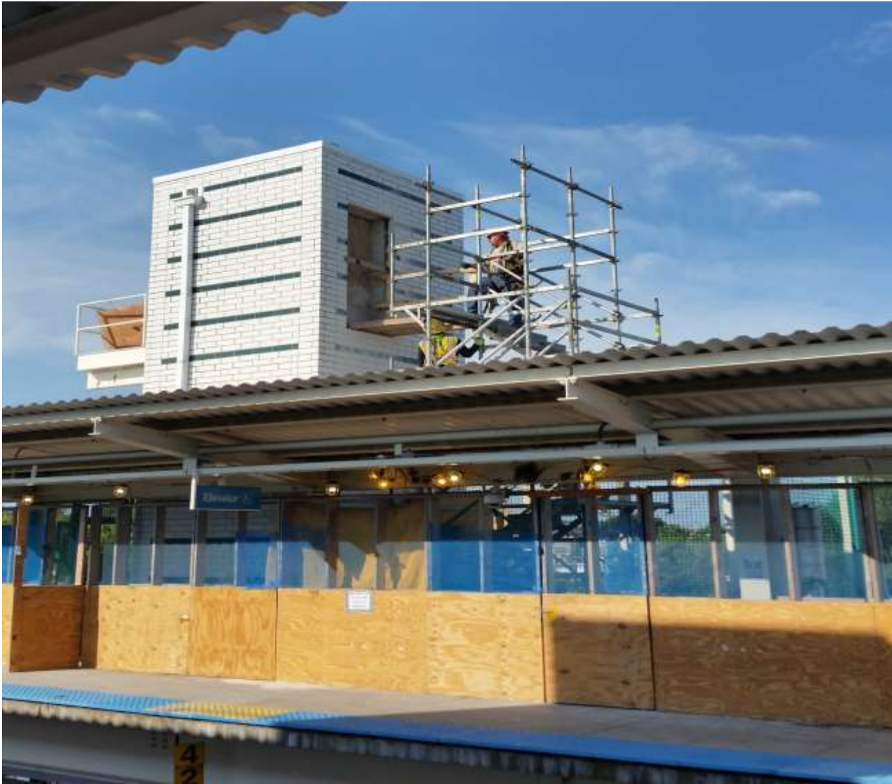
Demolition at West Elevator