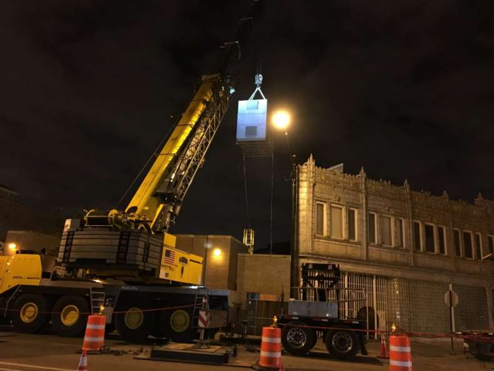
Removal of old 12.5 kV Transformer at Milwaukee Substation