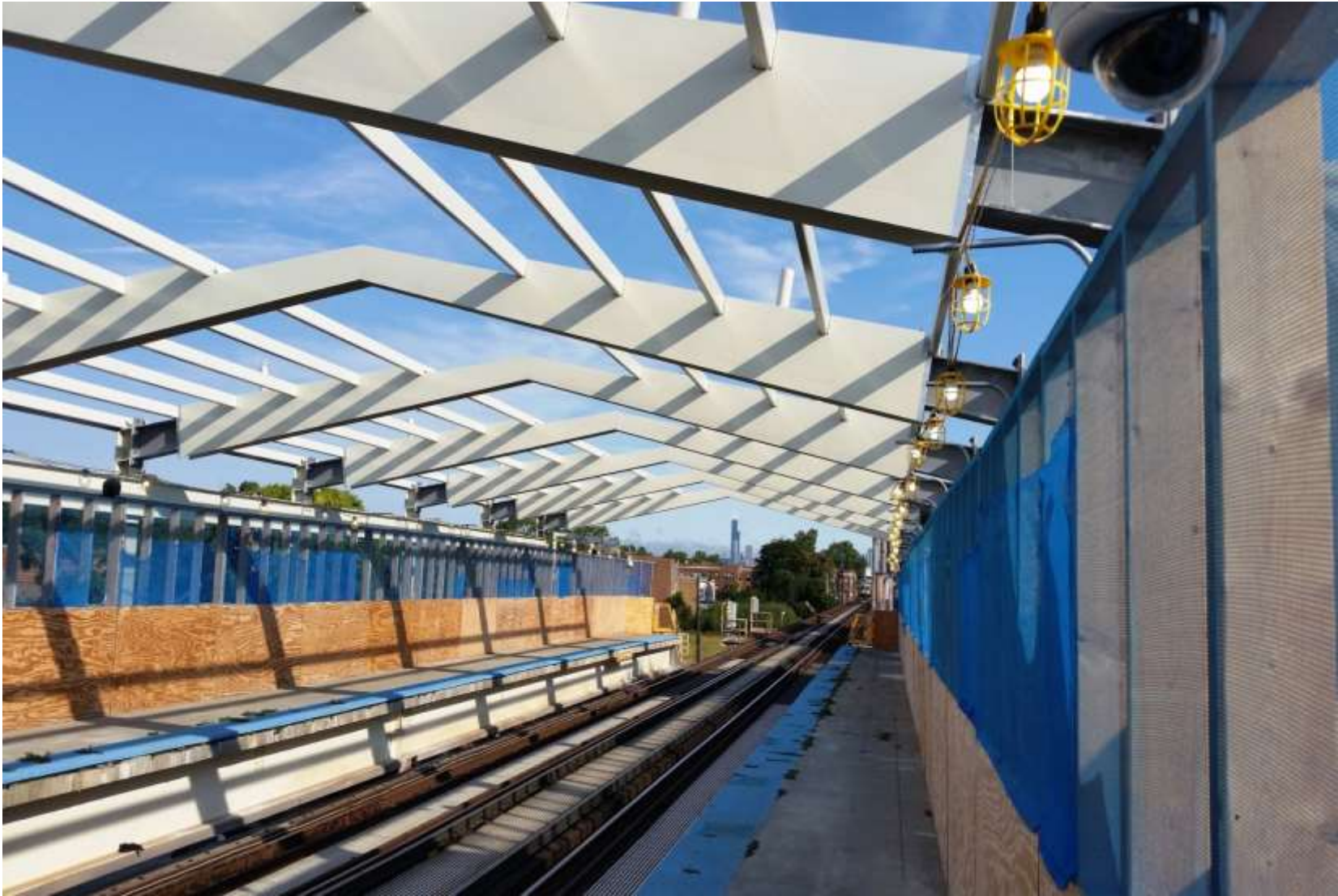
New Canopy Steel at Platform