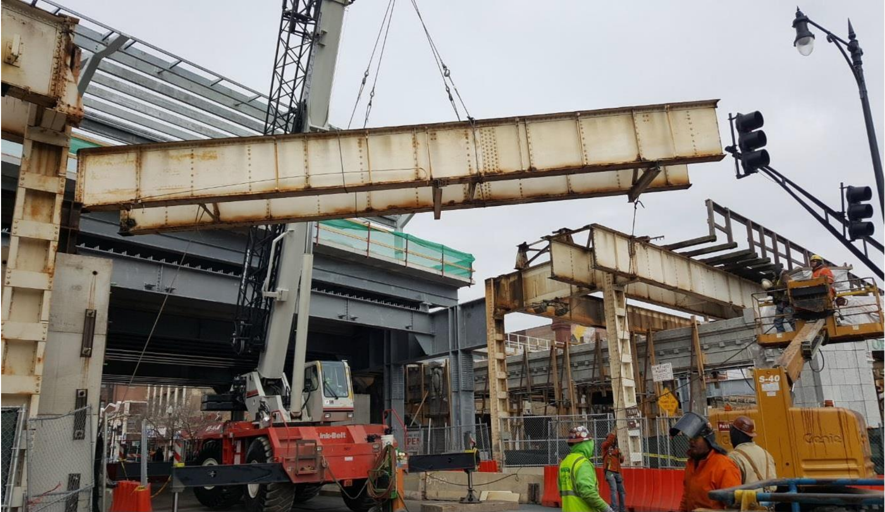
Track 4 Steel Demolition