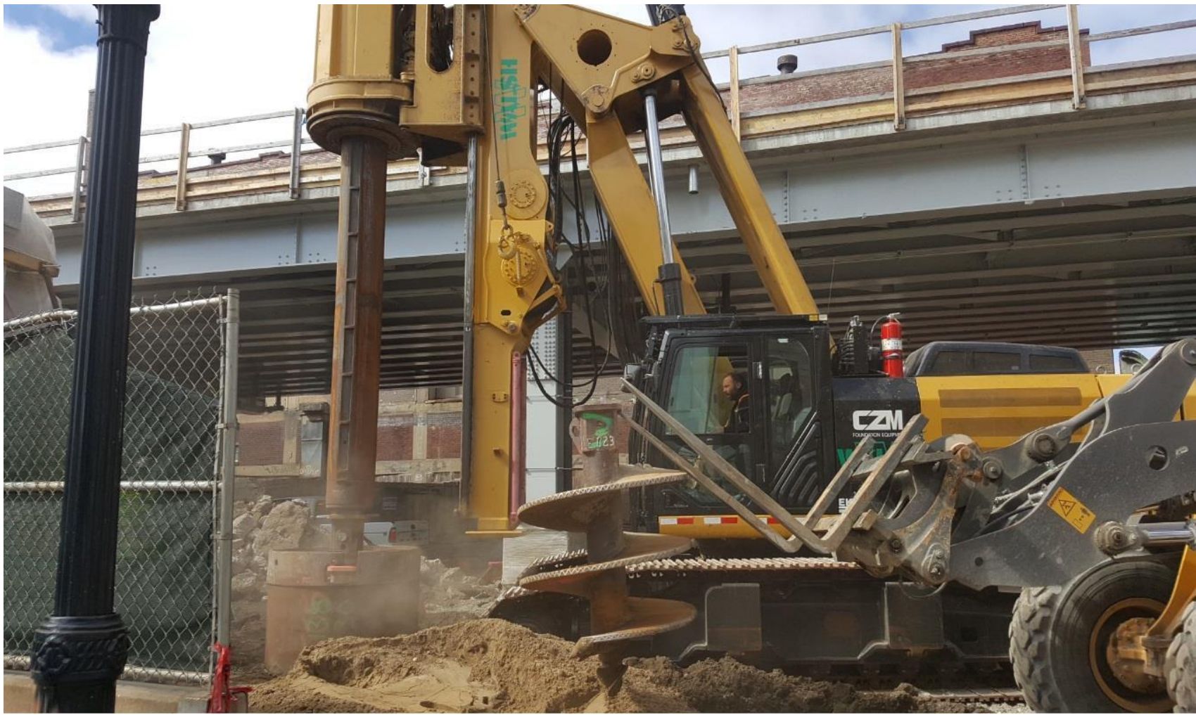
New Track 4 Caisson Drilling Operations