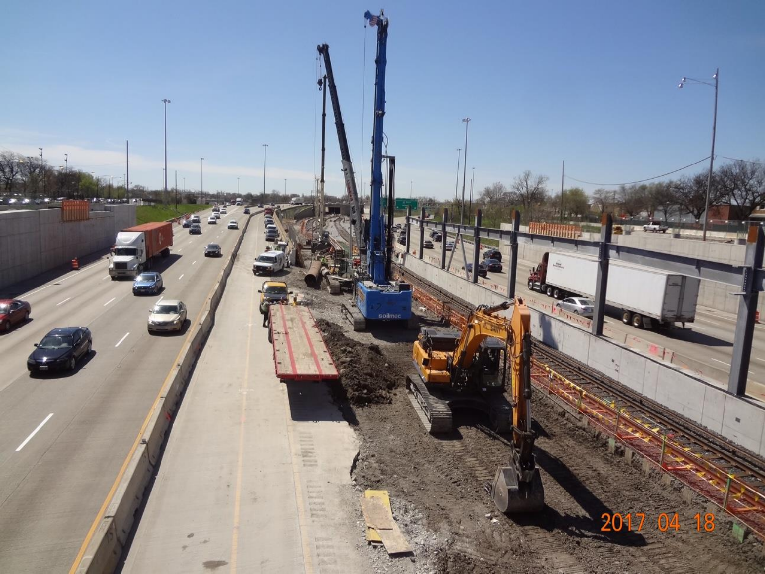
Barrier Wall Demo Complete, Caissons Installation Begins