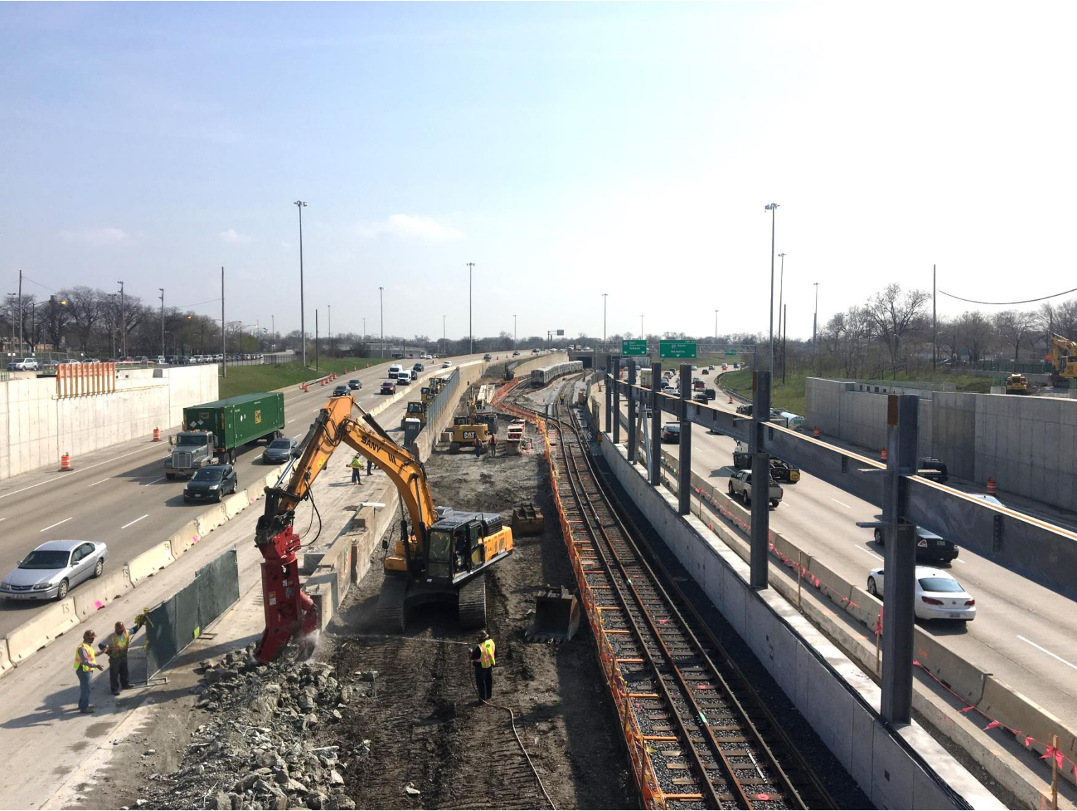
West Track Rebuilt, East Barrier Wall Demolition