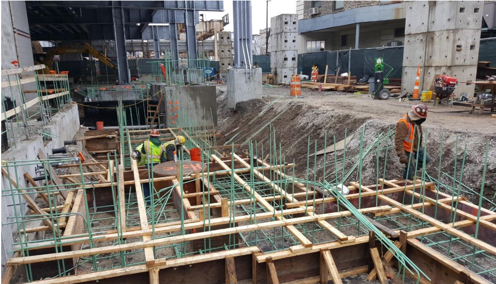
Wilson Main Station Foundation Build Out