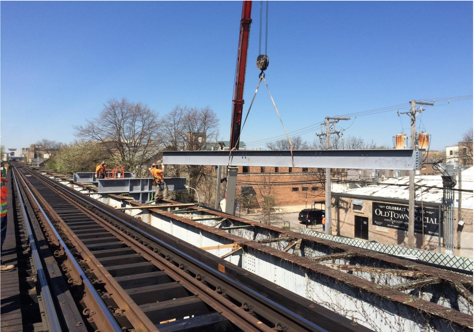
Installation Signal House Platform Steel at Cleveland