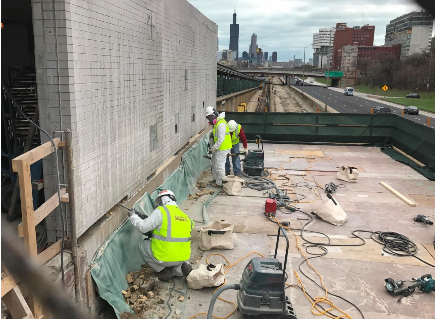
Damen Stationhouse Tuckpointing