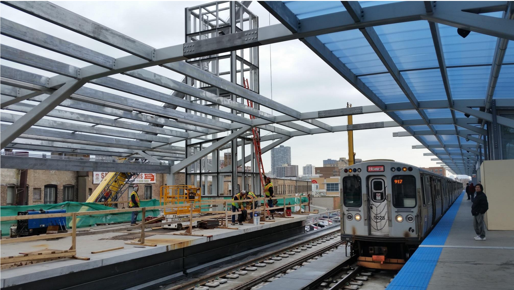
New East Elevator Steel Tower Frame Installation