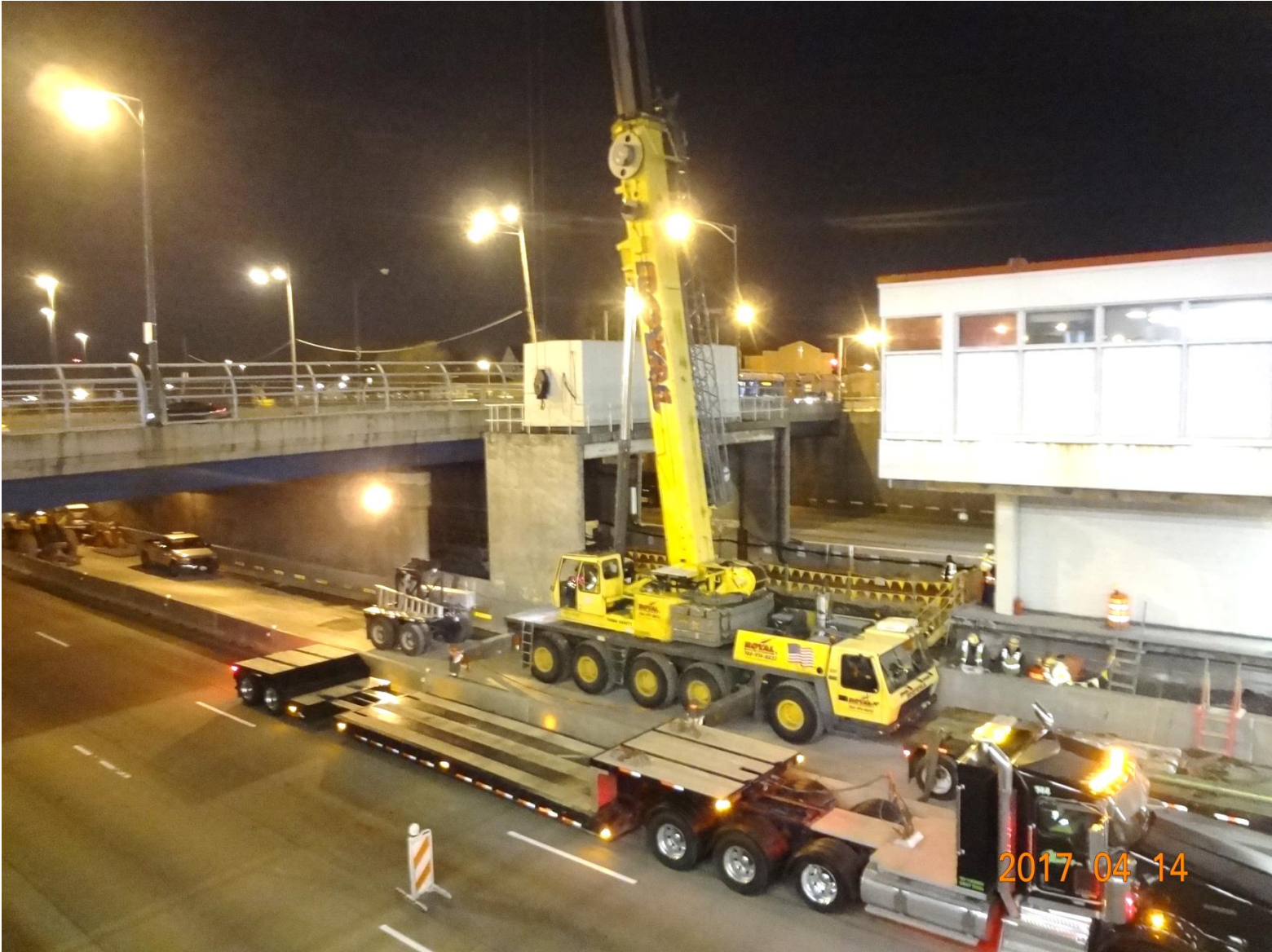
Signal Relay House Removal