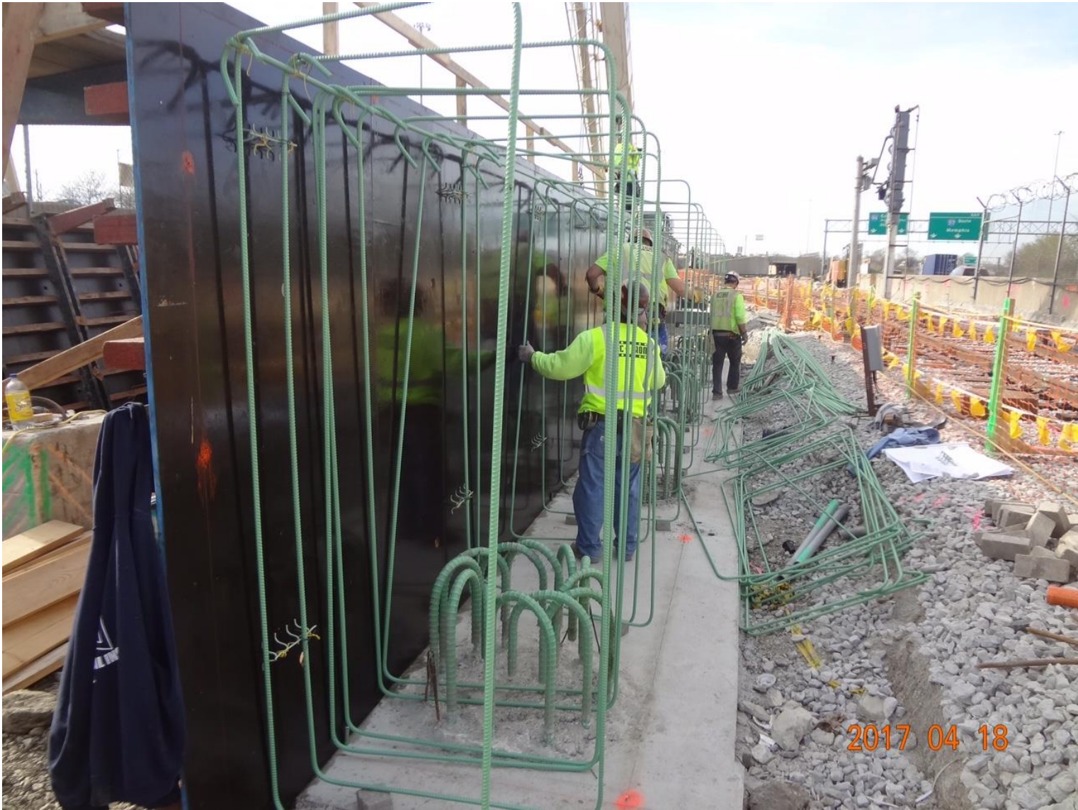
South Bus Bridge Pier Rebar and Formwork Installation