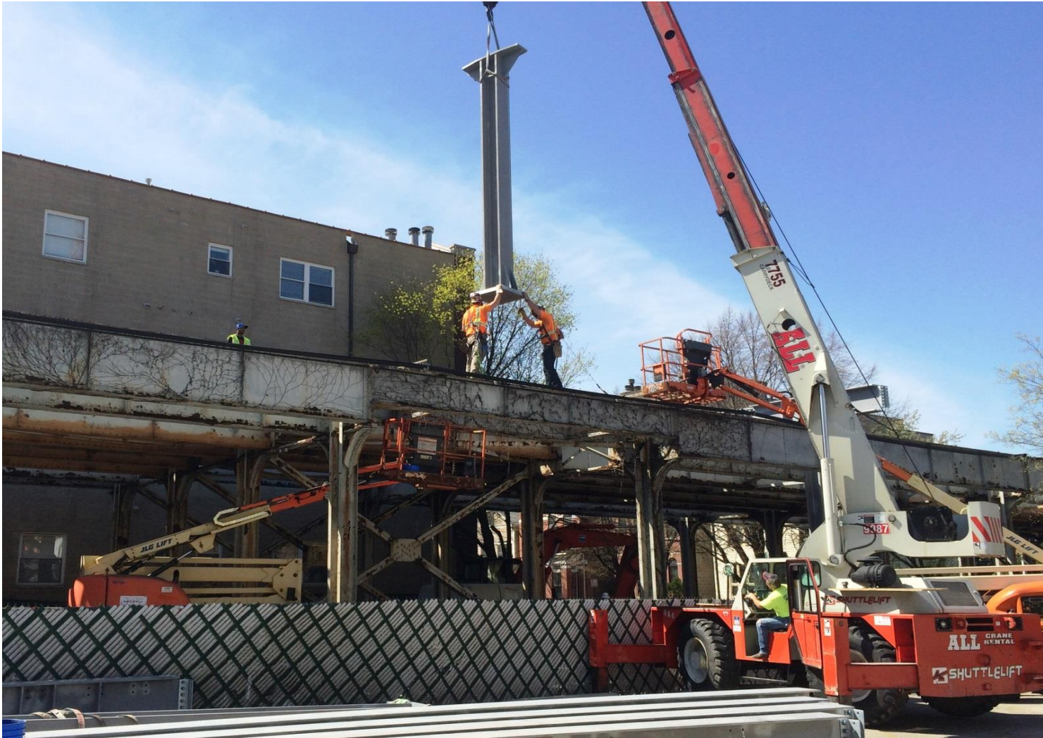
Installation Signal House Platform Steel at Cleveland