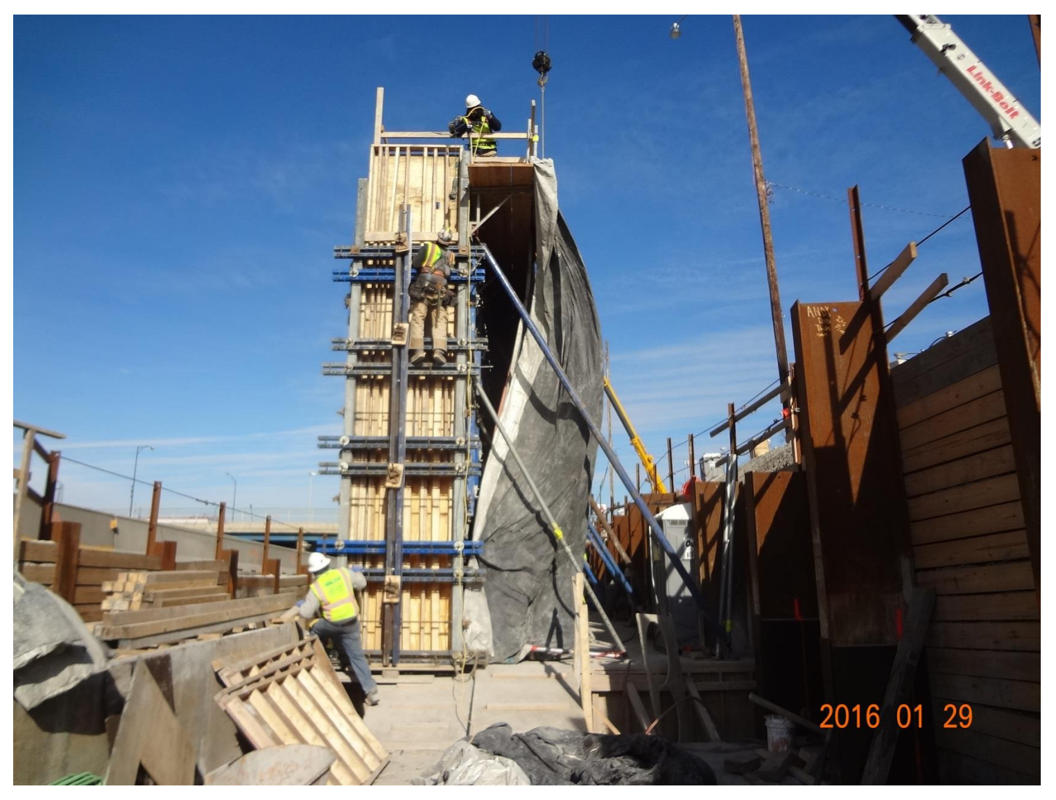
Concrete wall work in southeast corner