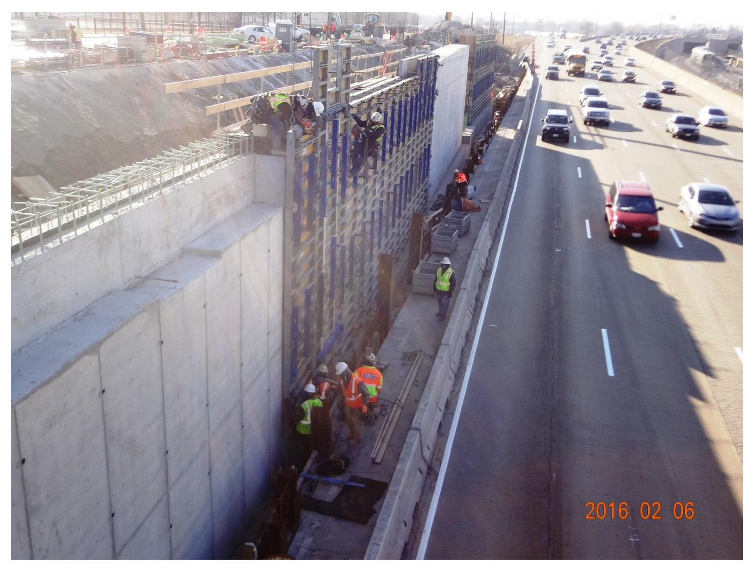
Concrete wall work in southeast corner