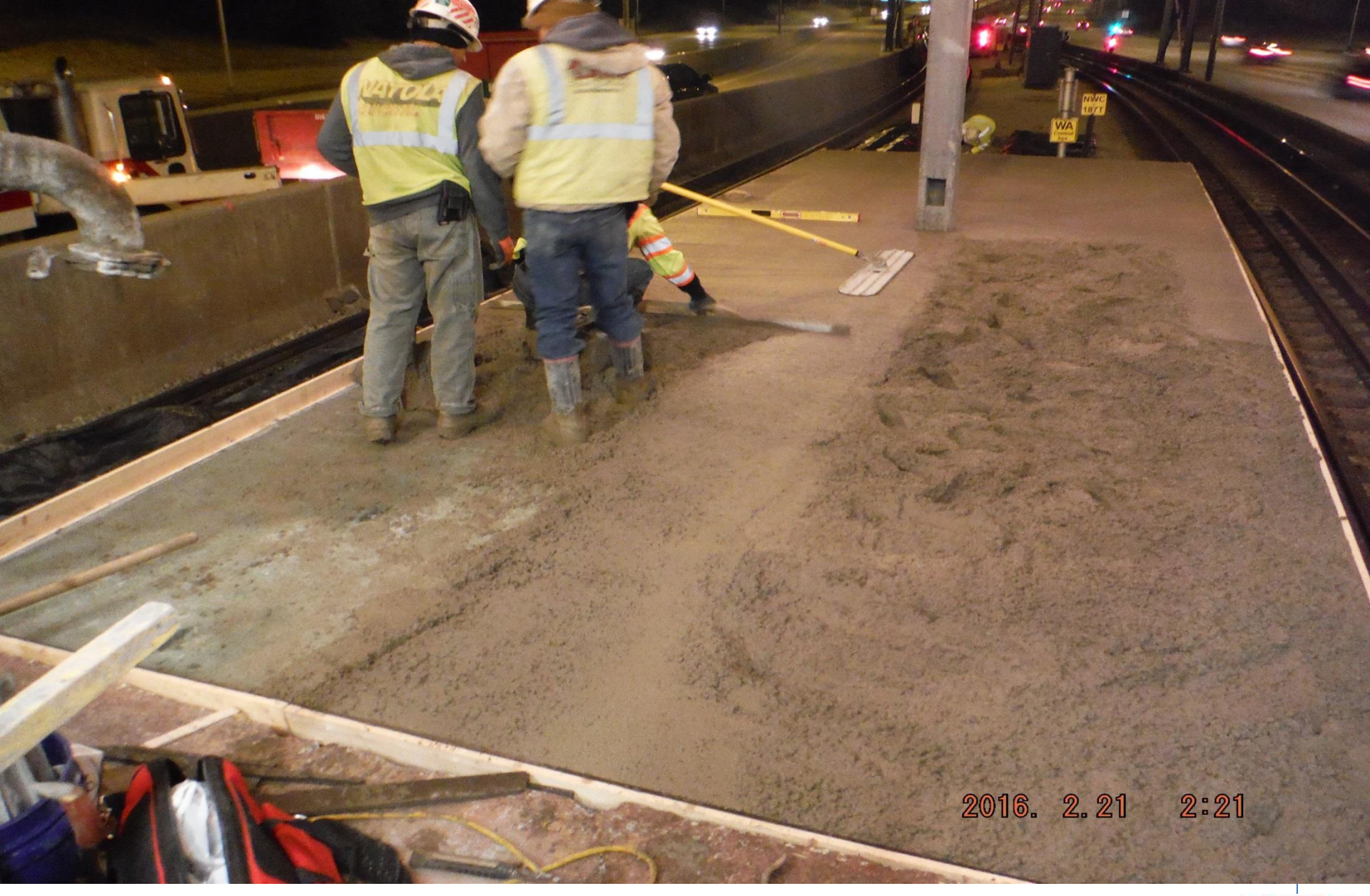
Addison concrete topping slab pour