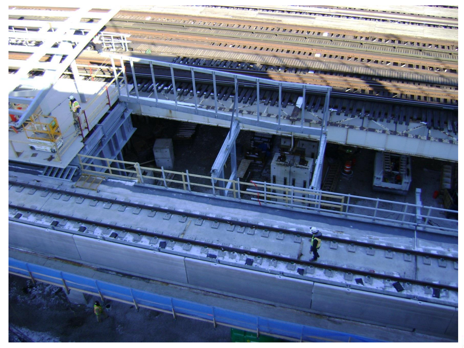
New Sunnyside ramp structure installation