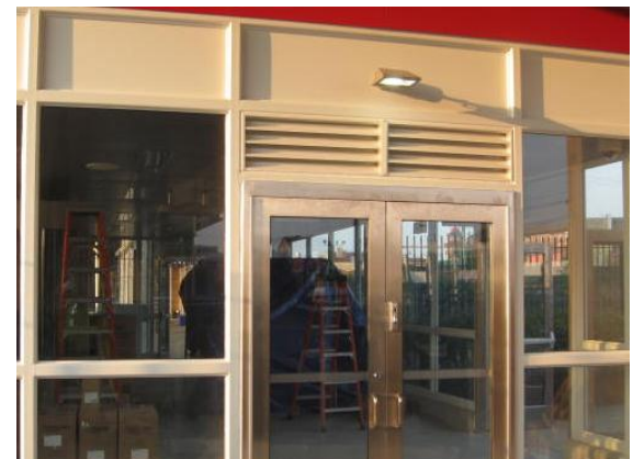
Auxiliary Entrance Opened June 2010