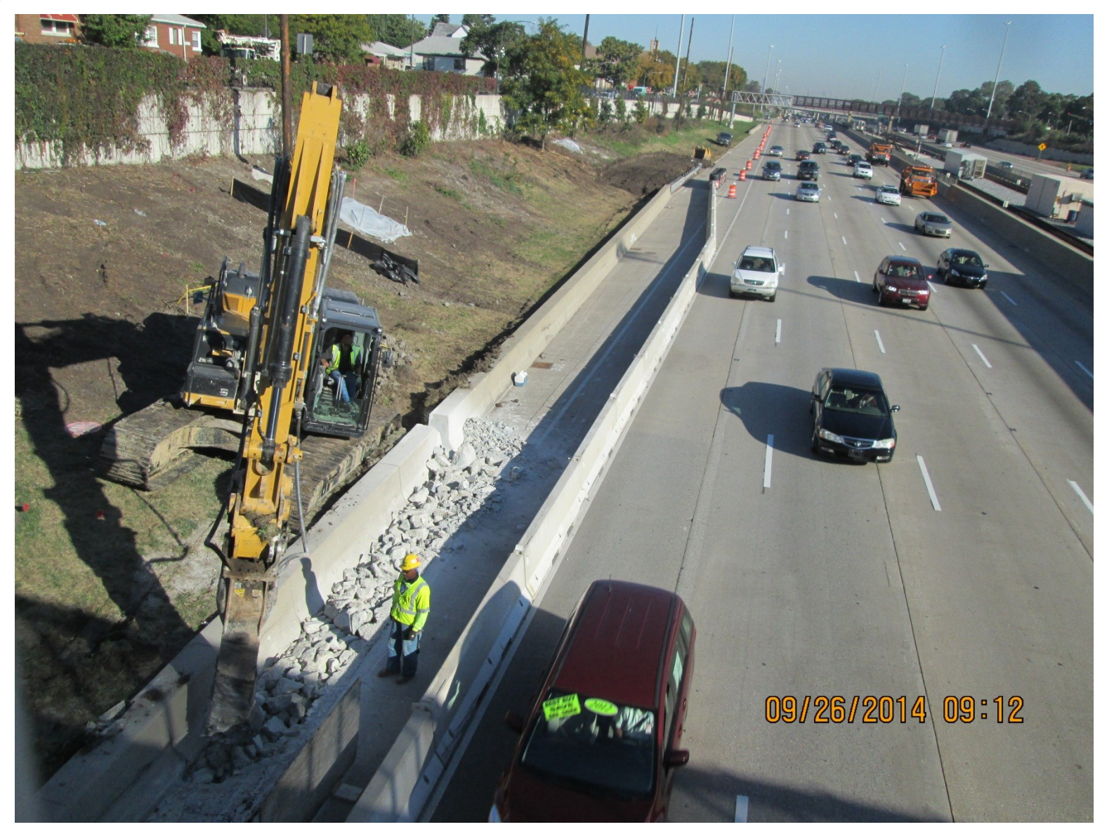
New Foundation Work