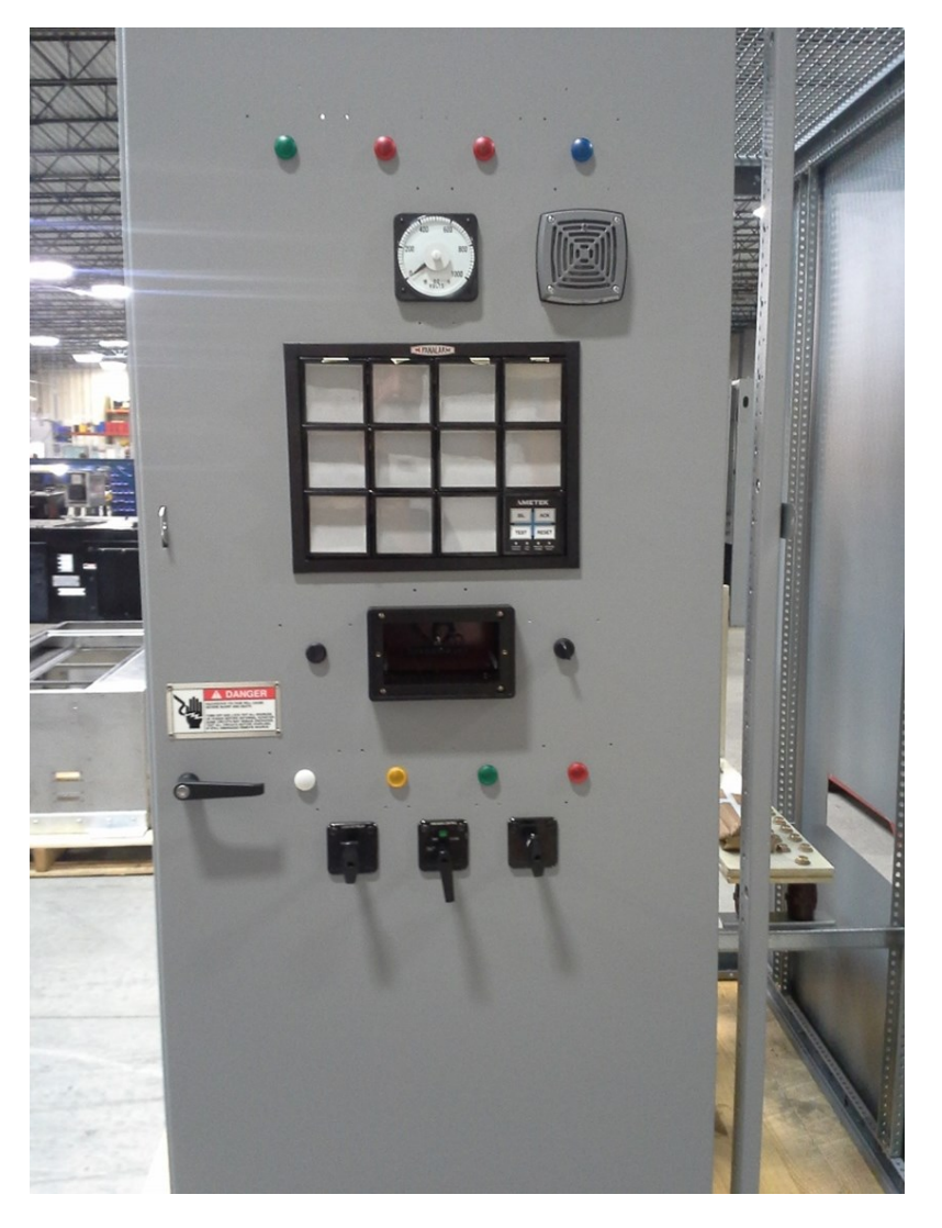
Rectifier Control Cabinet for Princeton Substation in Factory