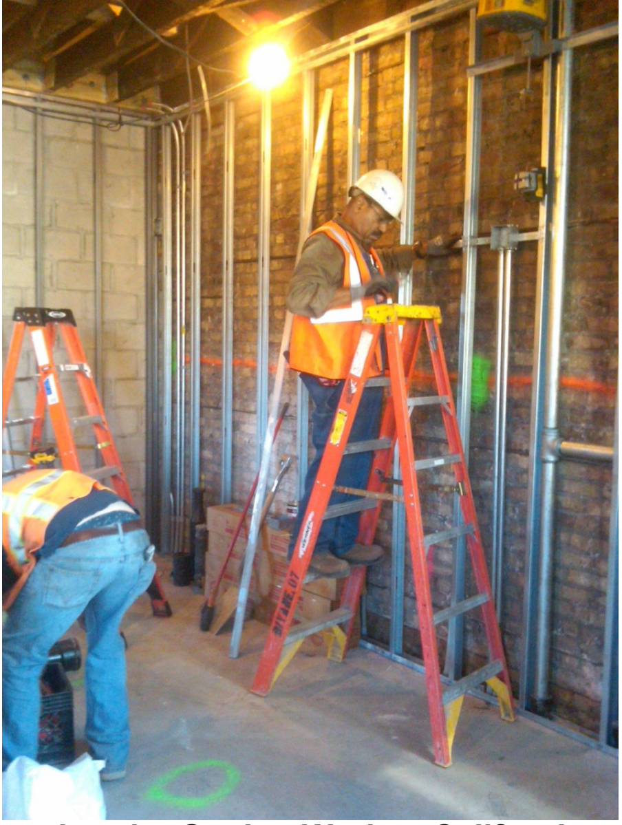
Interior Station Work at California