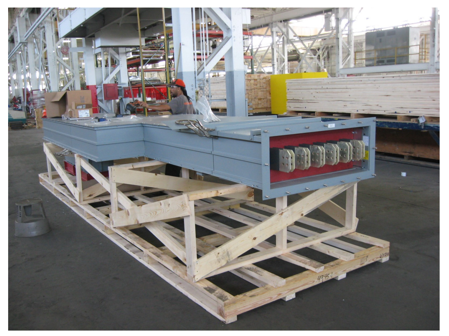
Bus Duct Assembly for Princeton Substation at Factory