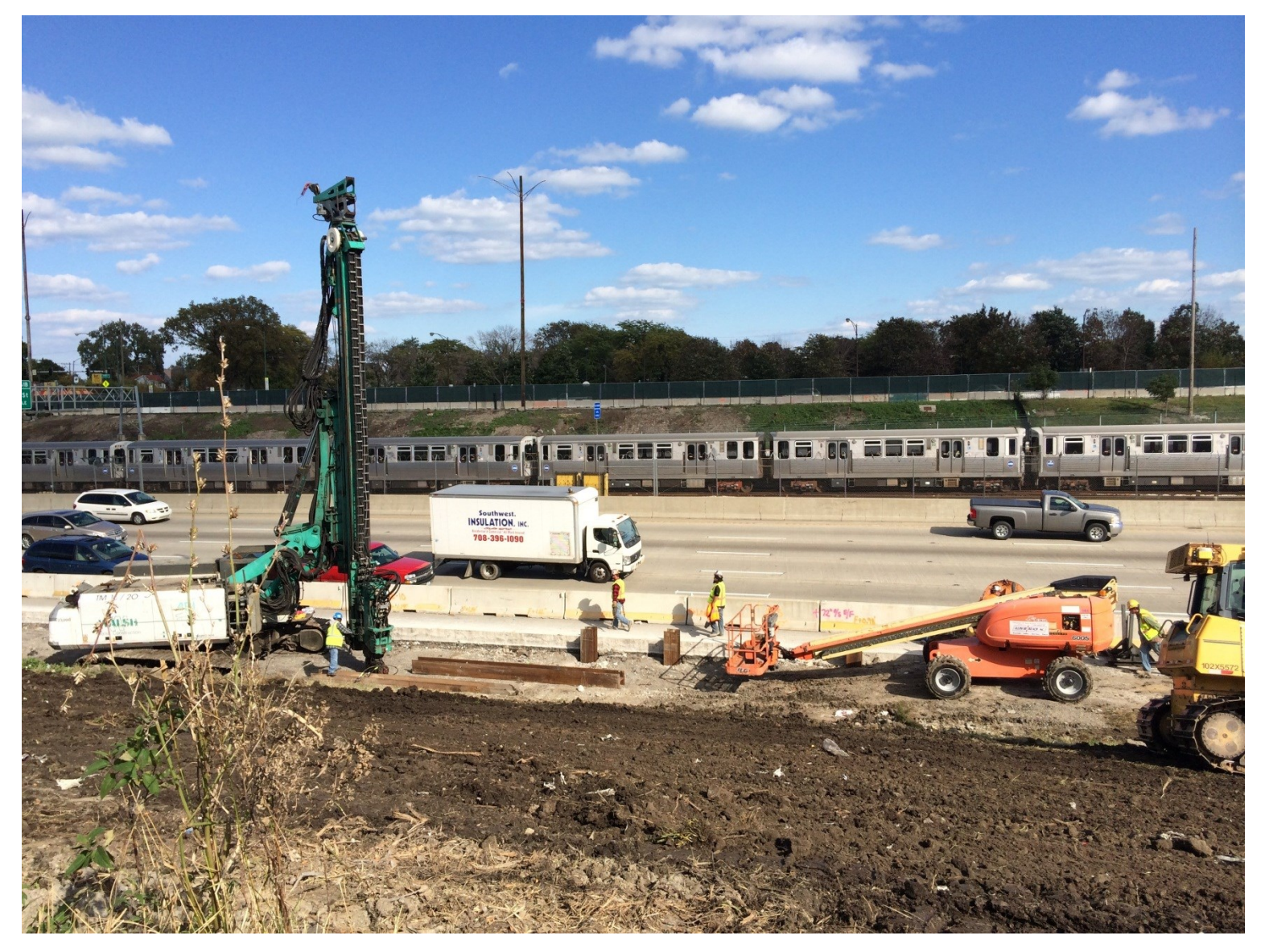
Installation of Steel Piles