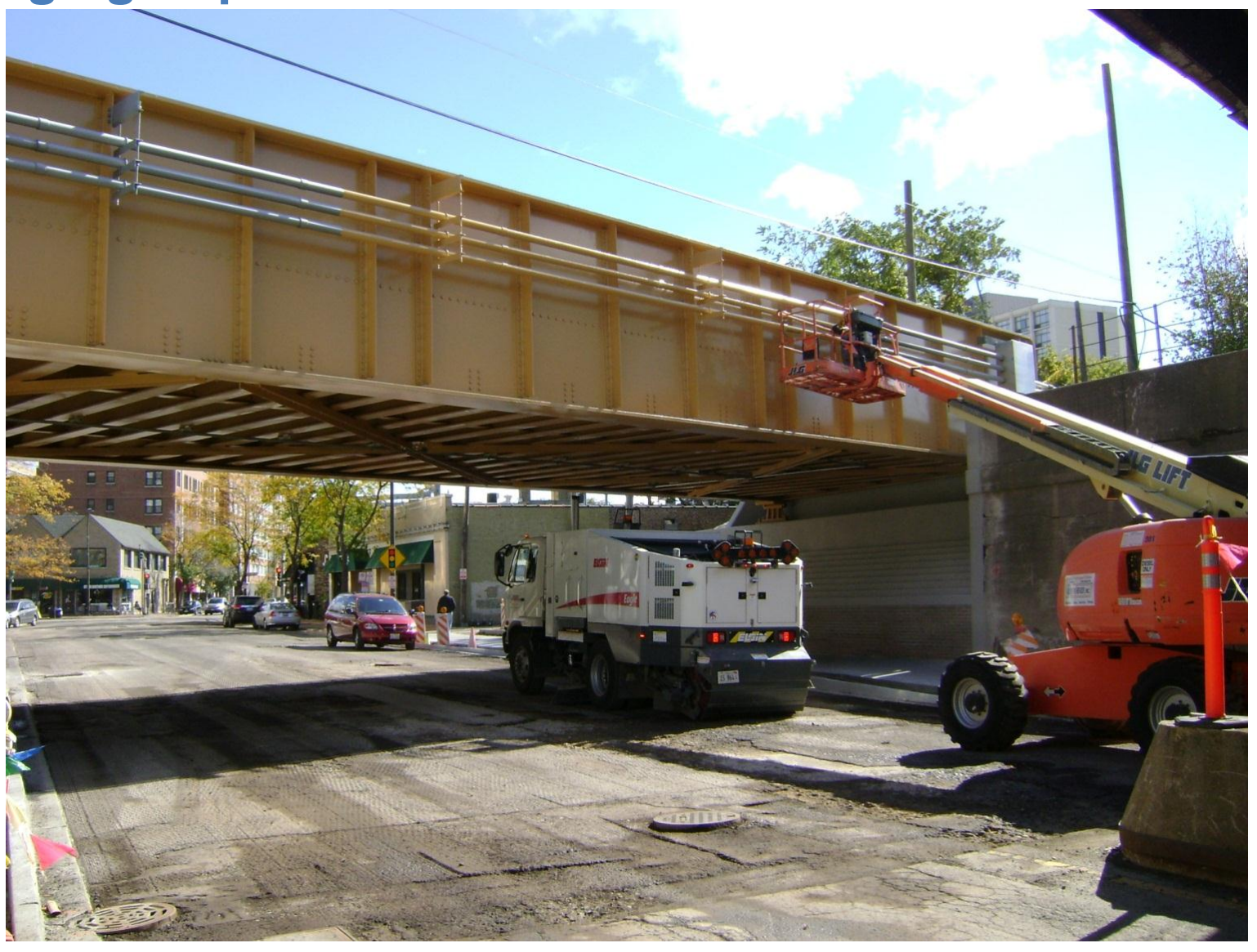
Grove Street – Milling Existing Pavement / Painting Conduit

Managing Department: Facilities Construction