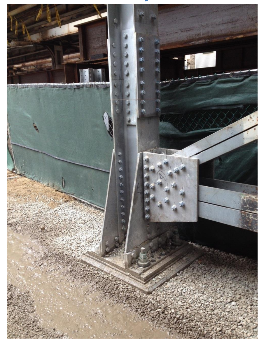
Armitage Substation: new column foundation