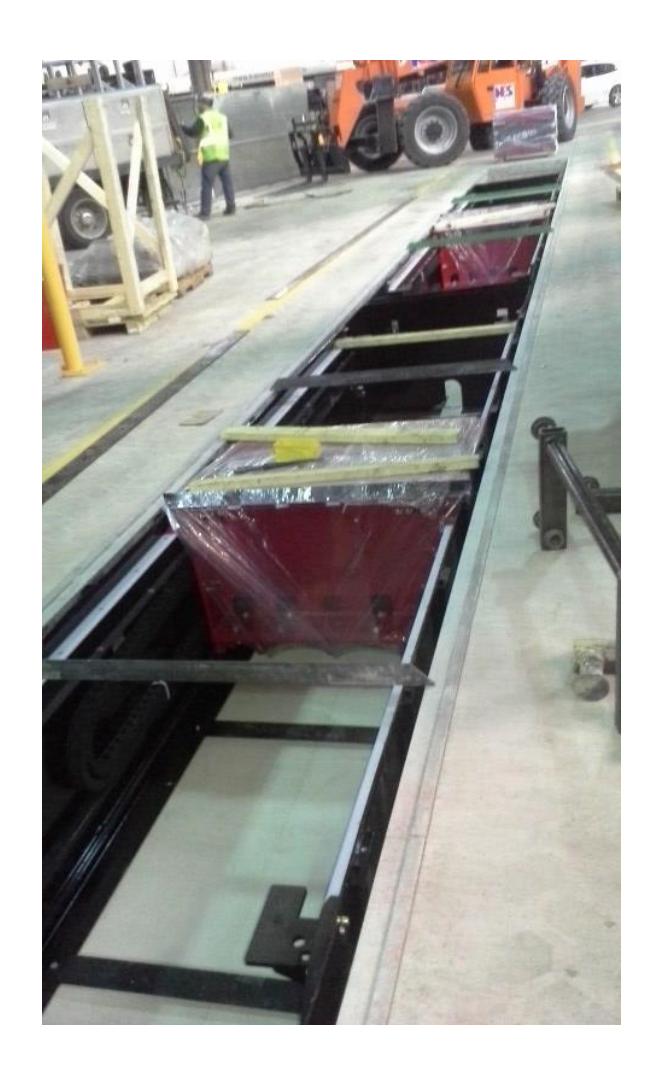
103<sup>rd</sup>- Lift Install