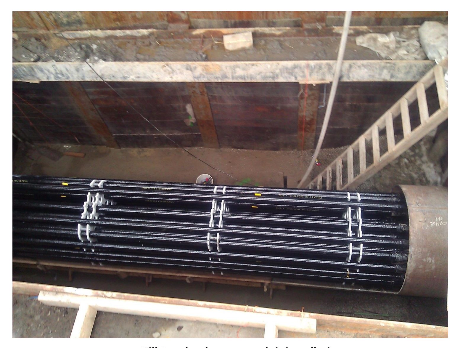
Hill Ductbank: new conduit installation