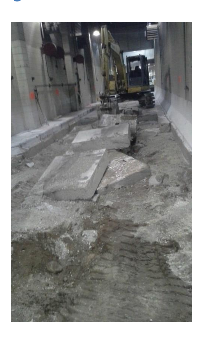
Chicago- Bay 12 Demolition