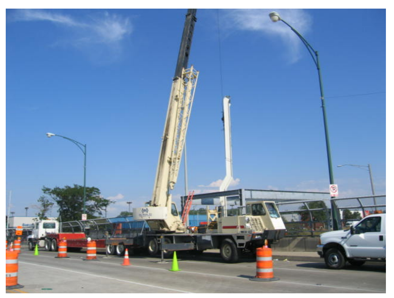
Stair installation at 69th Street station