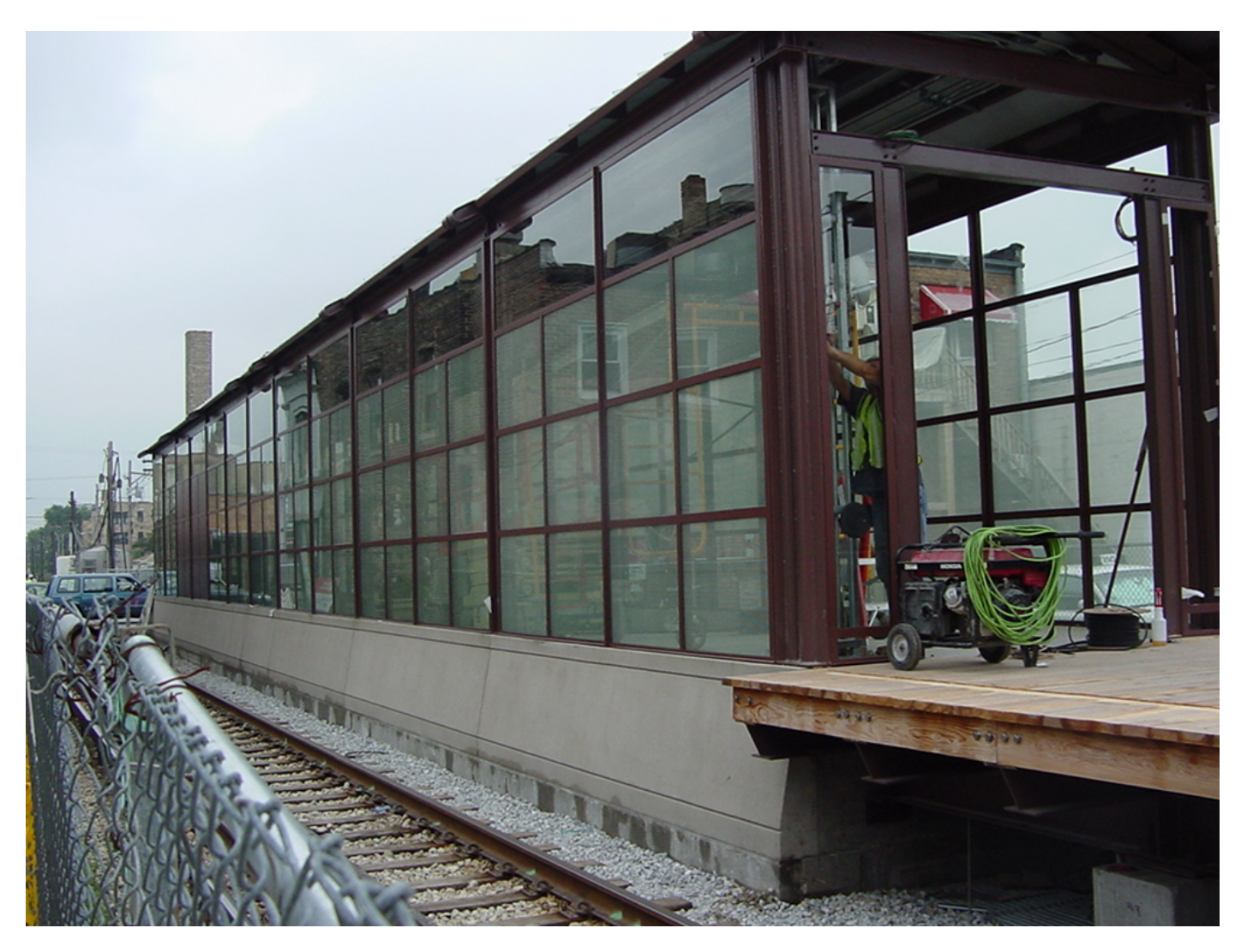
Kedzie station glass installation