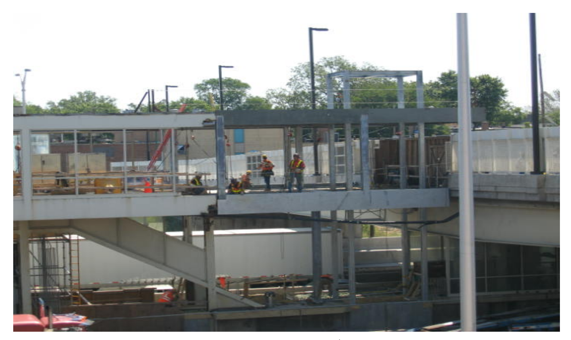
Elevator shaft construction at 69<sup>th</sup> Street station