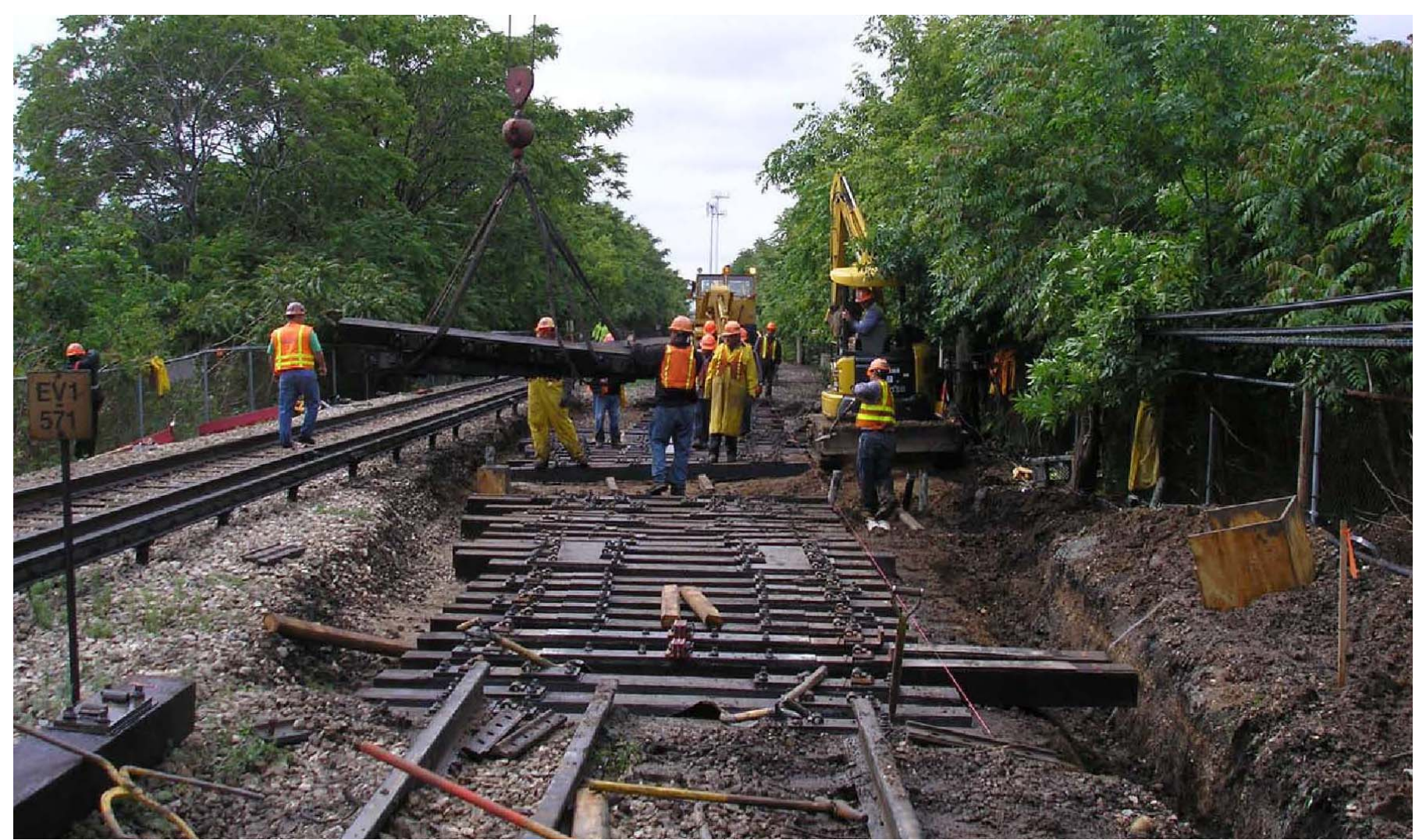
Installation of South Boulevard Crossover