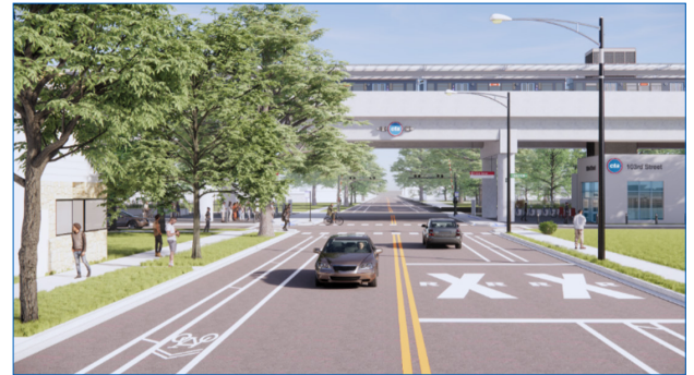
Example Red Line Extension Station Rendering: 103rd Street Station (Looking East along 103rd Street)

Visit transitchicago.com/rle/finaleis for more information, including an electronic copy of the combined Final EIS/ROD and Final Section 4(f) Evaluation and a list of 11 locations where hard copies are available through September 12.