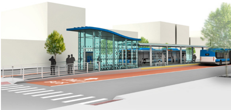
Conceptual Rendering of an Ashland BRT Station

The purpose of the Ashland Avenue BRT Project is to expand connectivity to the region's existing transit system by providing a new and upgraded high quality, high capacity and cost effective premium transit service—a service which provides faster, more reliable, and comfortable passenger experience. The proposed project would address the transportation needs of expansive population and employment growth outside of the Central Business District or “Loop” and support local and regional land use, transportation and economic development initiatives. Specifically, the project will improve accessibility, mobility, transit travel times and reliability, and passenger facilities in this heavily transit reliant corridor.