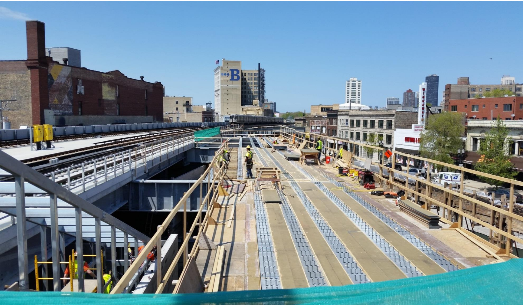
New track 4 decking installation