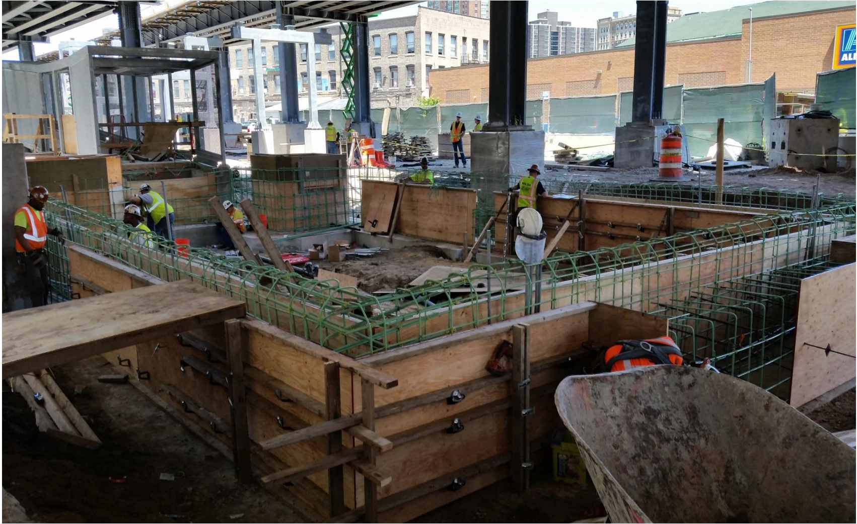
Sunnyside station excavation/foundation build out