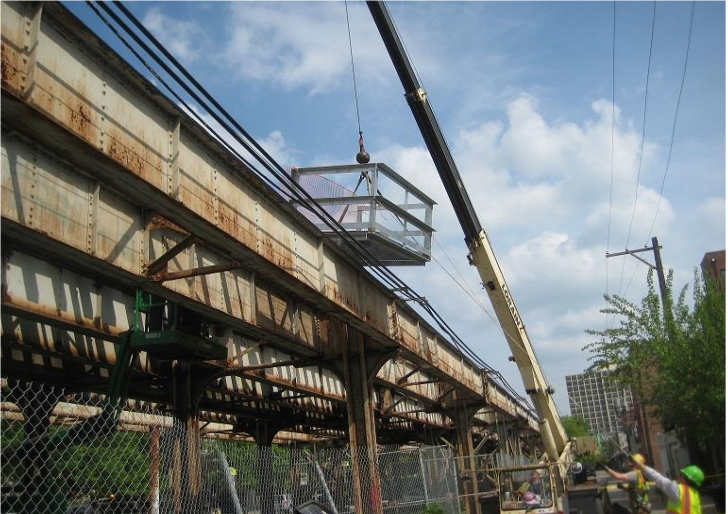
Installation of wayside signal platforms