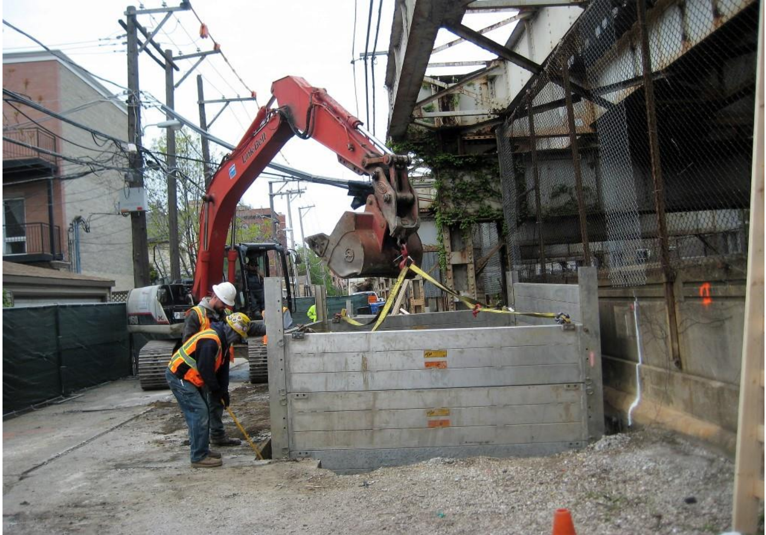
Foundation excavation at Willow Relay House site