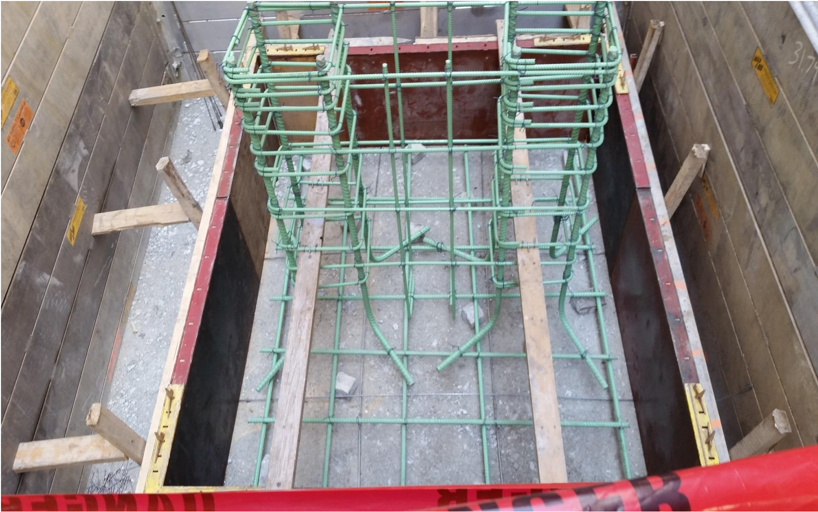
West side stair foundation rebar