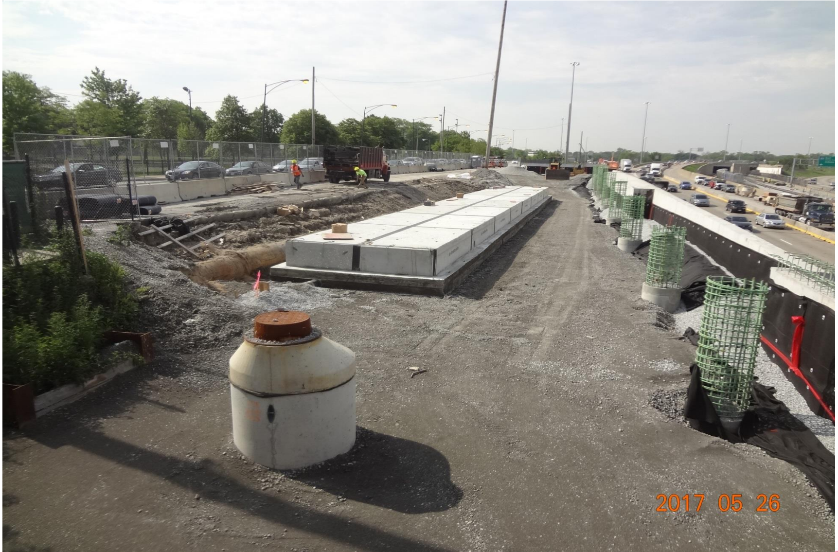
East side bus terminal area; drainage detention structure