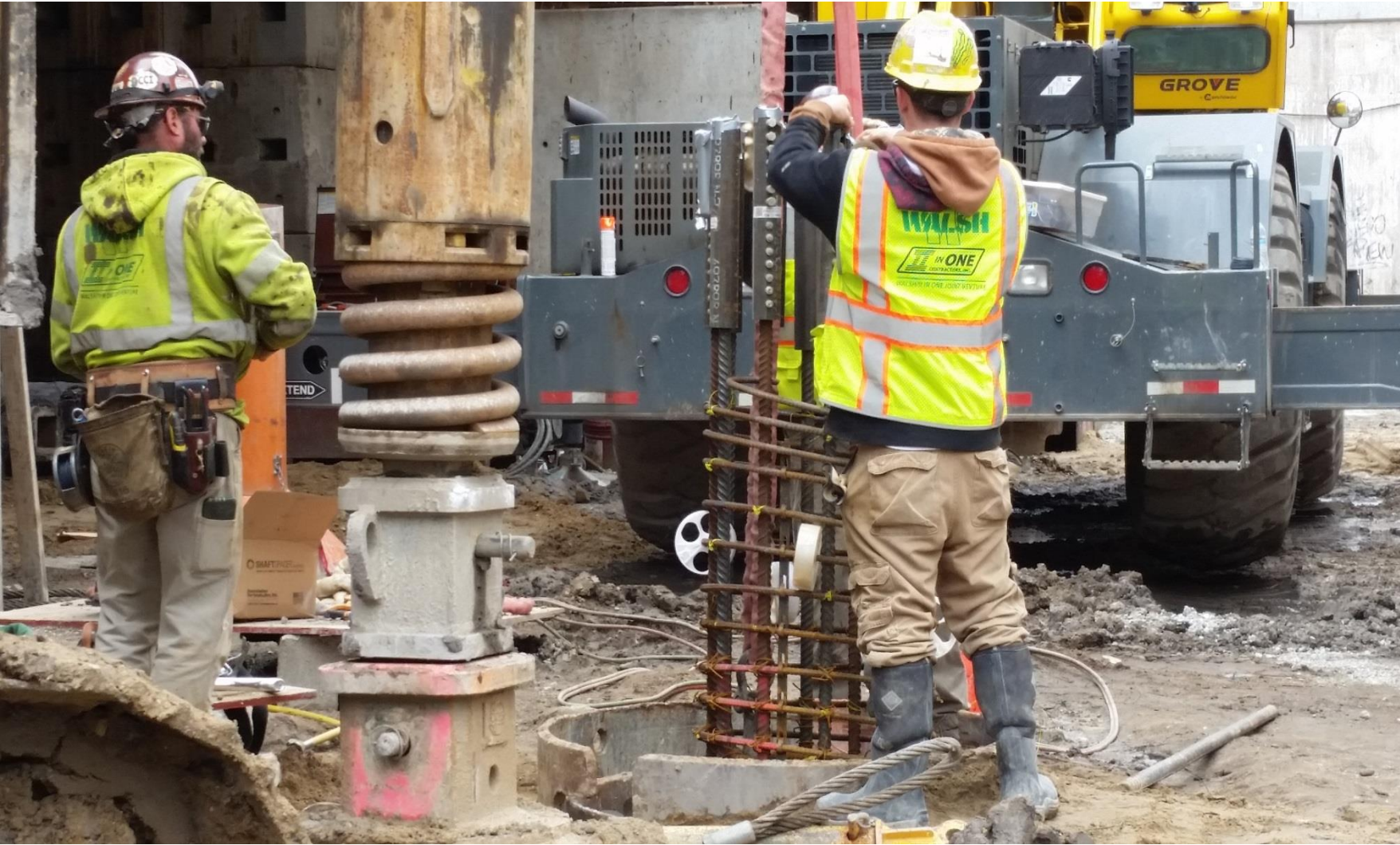
Final caisson installation