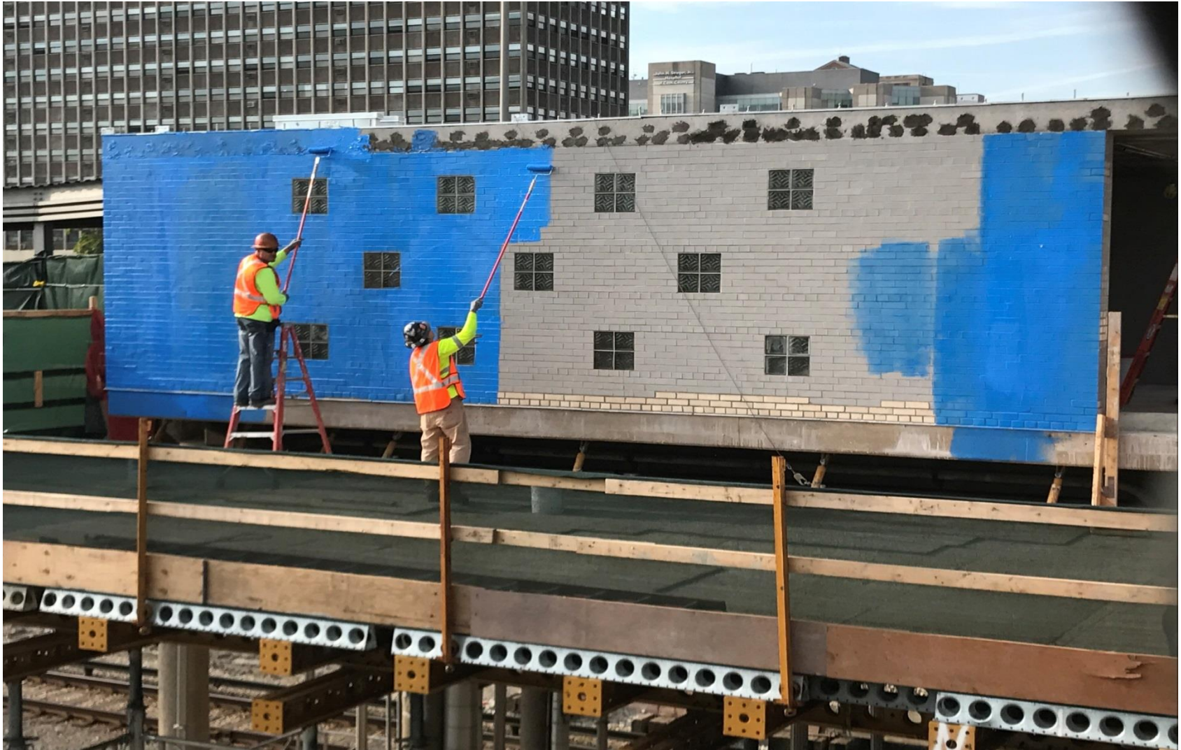
Damen Stationhouse waterproof application