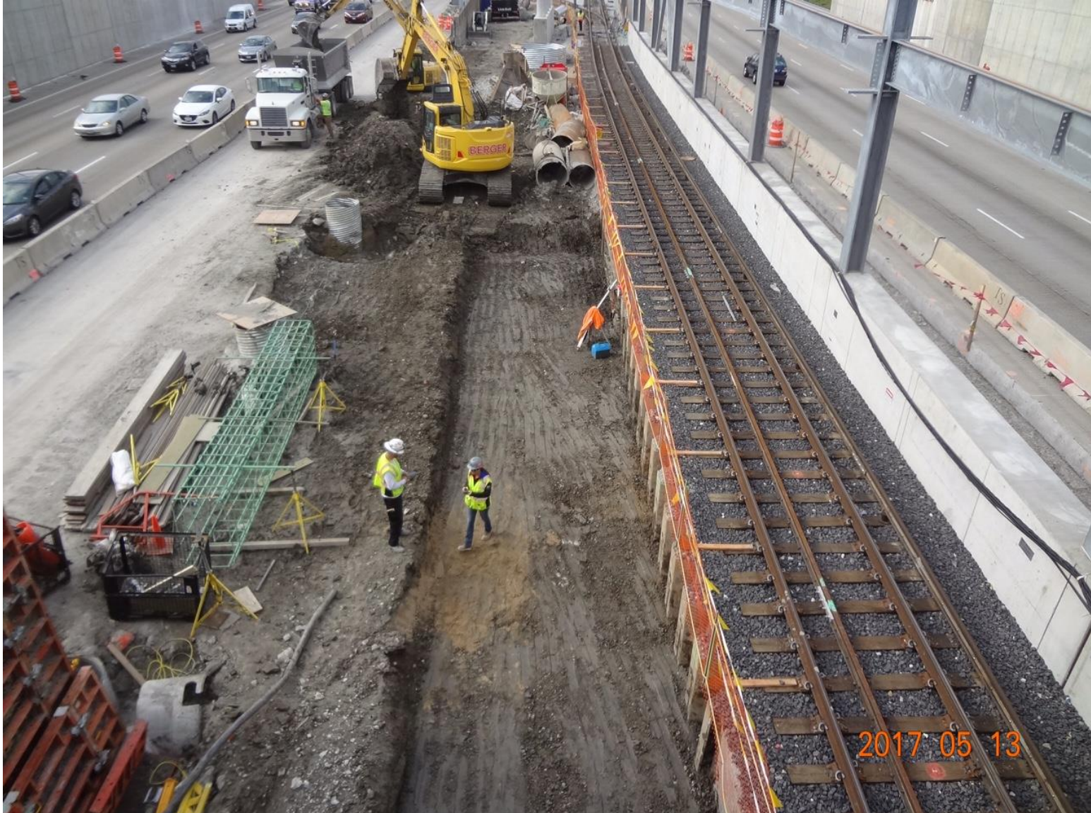
South Terminal platform subgrade prep work