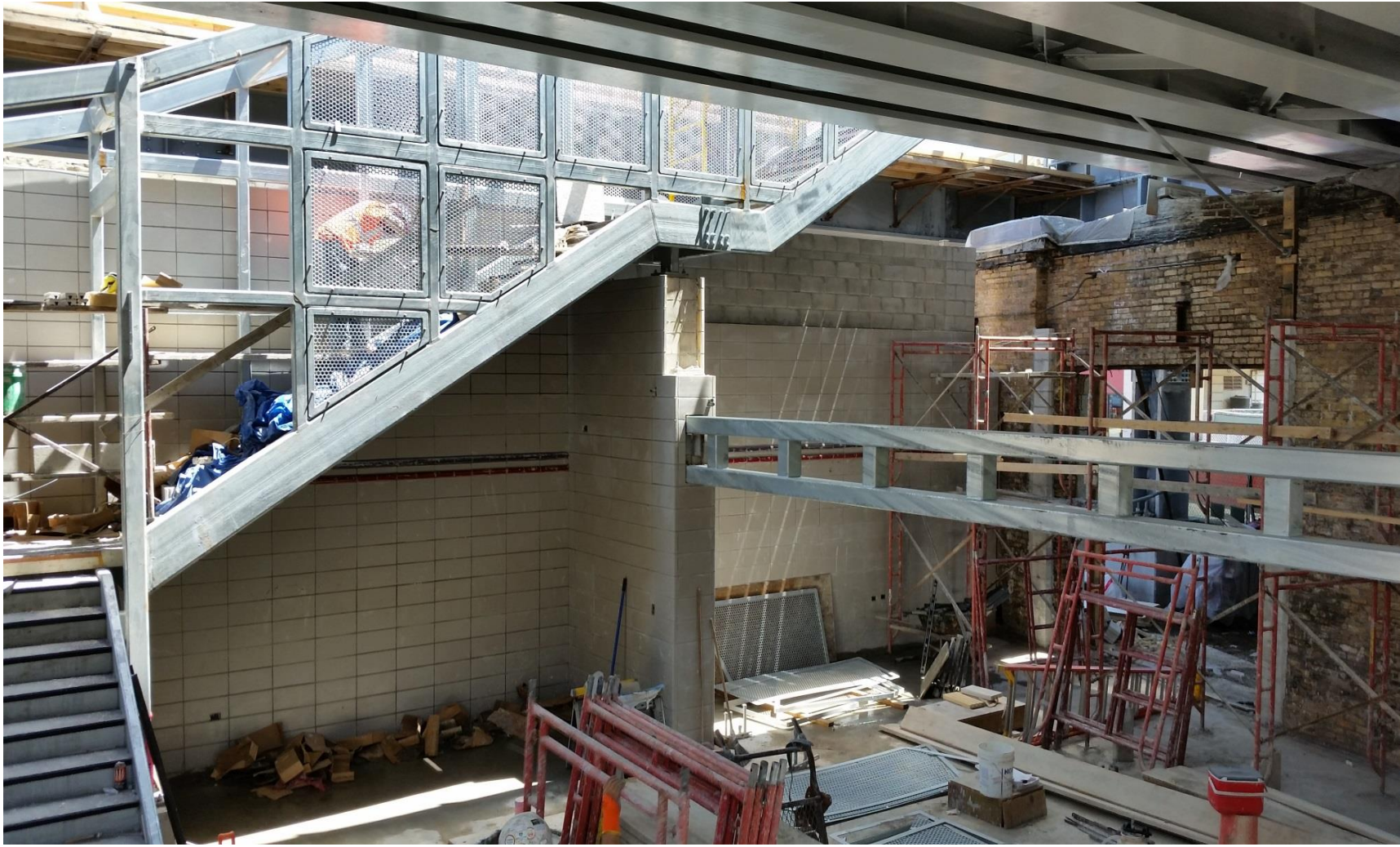
Wilson Auxiliary station build out