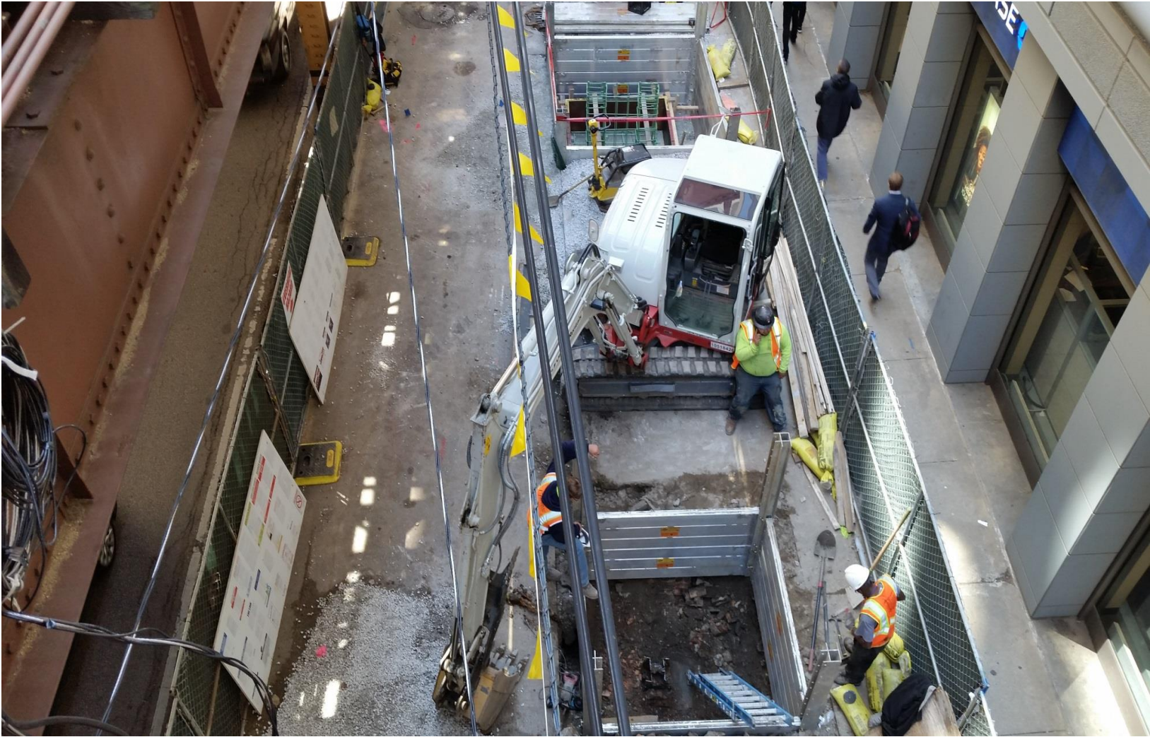
West side stair foundations