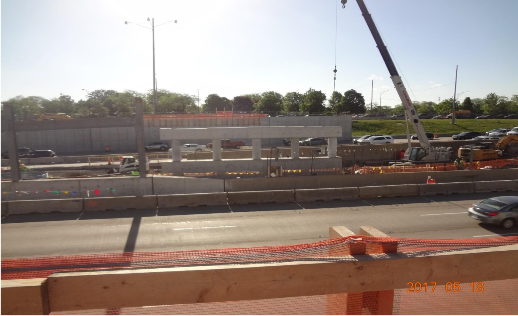
South Terminal bus bridge pier