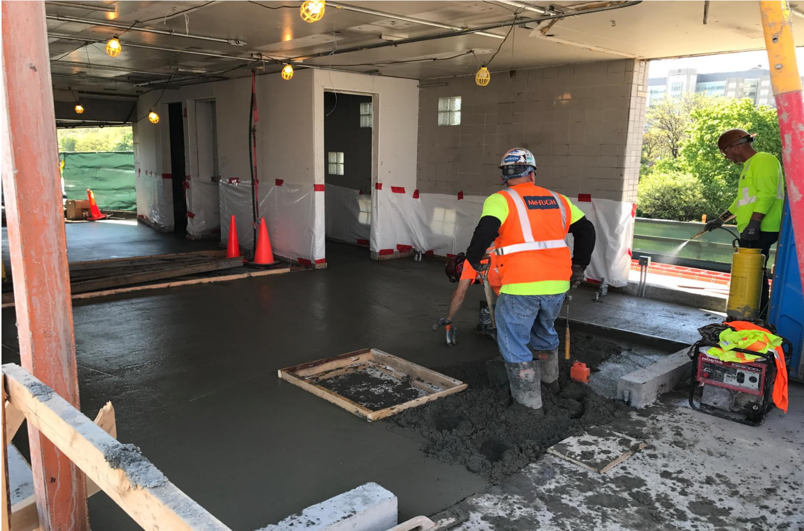
Damen Stationhouse topping slab